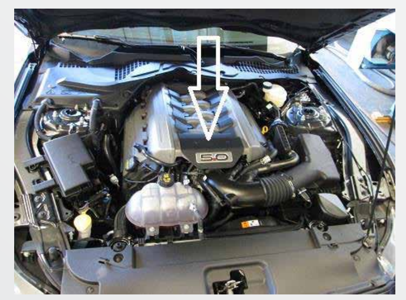
Remove the engine cover by pulling up on it to release its mounting pins from the grommets on the intake manifold.