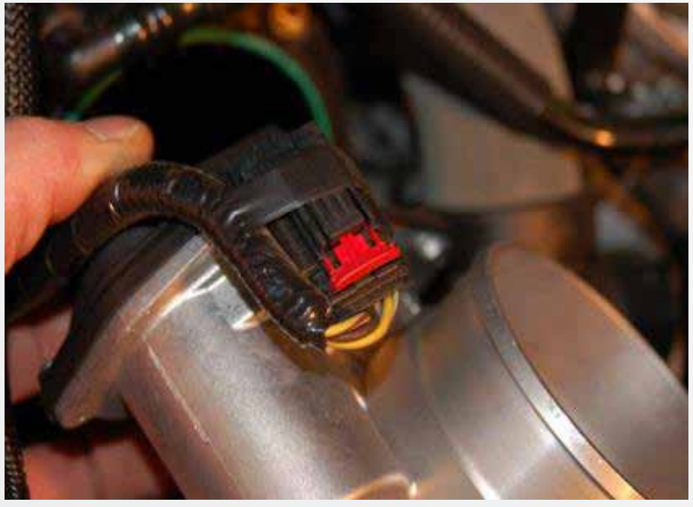
Remove the four mounting bolts from the stock throttle body, as you remove the throttle body flip it to unplug the motor plug on the bottom.