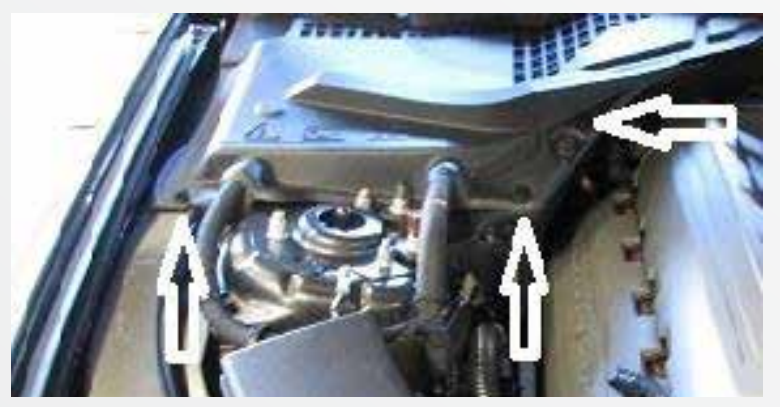
Remove the (3) pin screws that hold the battery cover to the chassis. Disconnect the negative battery terminal.