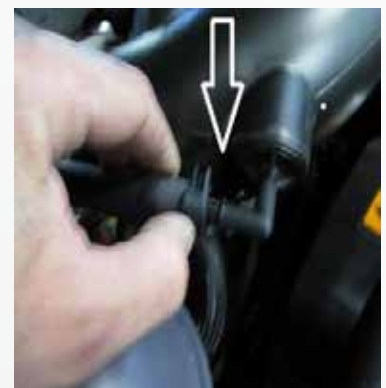
Disconnect the sound tube and the (3) smaller plastic breather hoses from the air inlet tube.