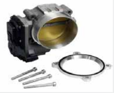
Wipe off the stock rubber throttle body gasket to remove any oil or debris. You will be reusing this gasket. Connect the motor plug to the BBK manifold. Use the supplied bolts to secure the throttle body to the intake manifold.