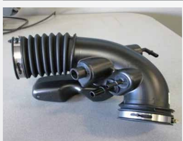
Loosen the (2) clamps on the air inlet tube at the air box and throttle body. And remove the air tube from the vehicle.