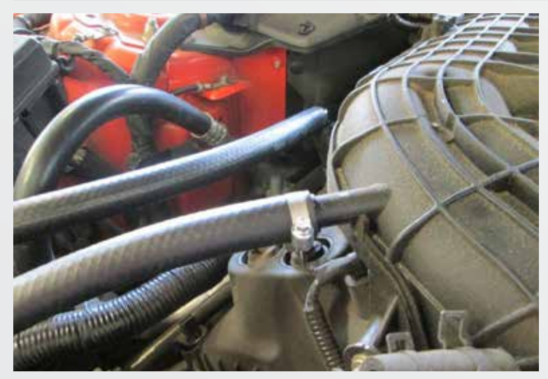
Make sure to use supplied clamps at engine connections.