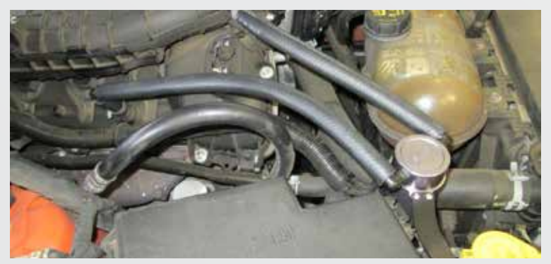
Remove factory PCV hose then install Oil Separator Kit as shown in picture. Making sure the shorter hose goes to intake manifold/draw side.