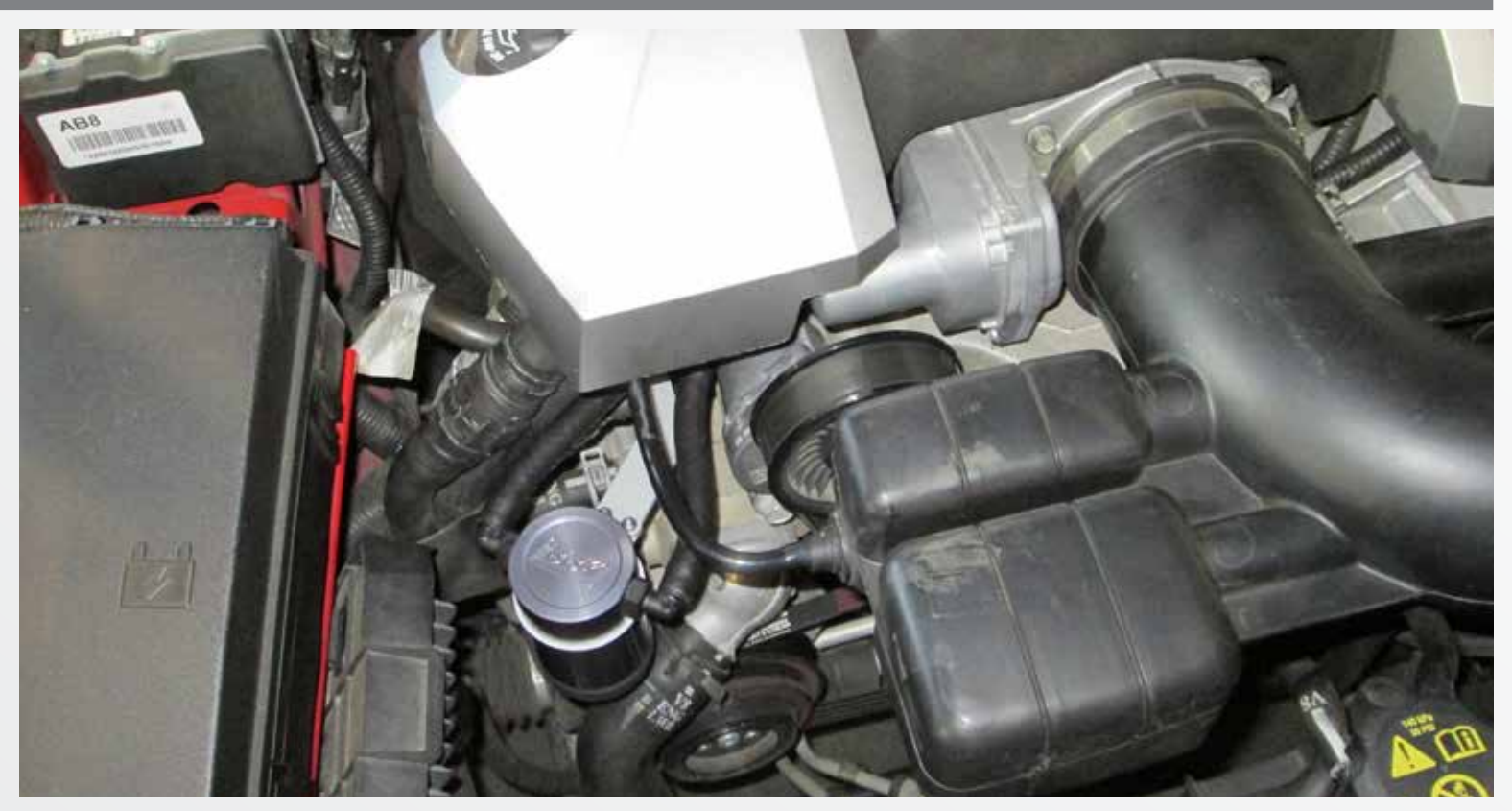
Now double check all connections then install throttle body, air box and engine cover.