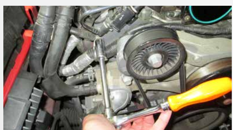
Using 15mm socket and extension remove factory engine harness nut leaving harness in place.