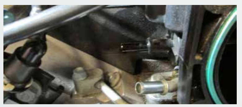
Remove factory air box and throttle body to help in removal of factory crossover hose and install of BBK oil separator kit. Remove factory hose by pushing aside the factory clip and pull outwards.