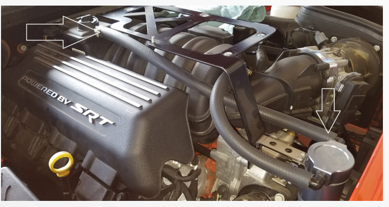
Using the longer vacuum line and clamp supplied in the kit install it onto the crankcase breather at the back of the engine, and connect it to the BBK catch can as shown in picture.