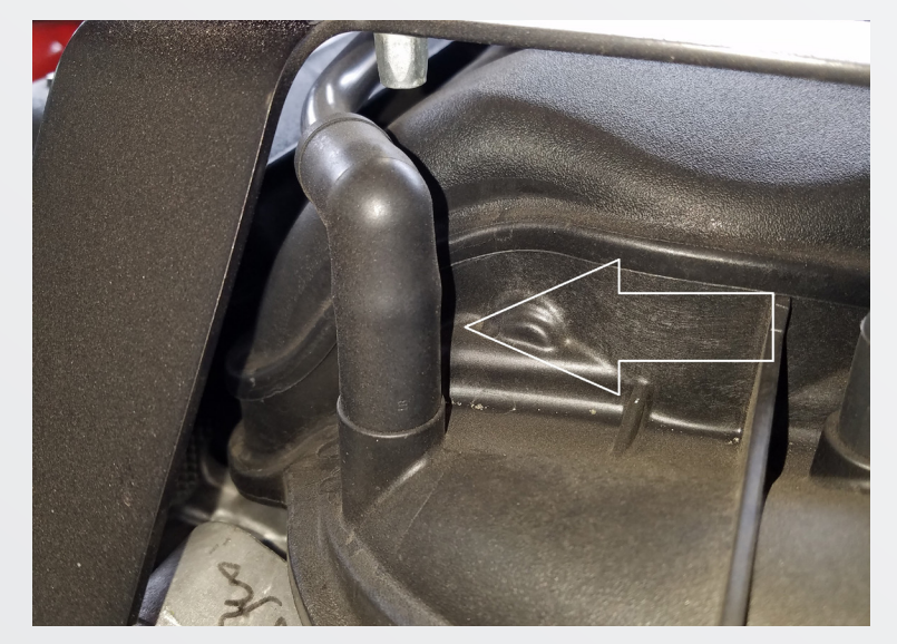
At the front of the engine disconnect the vacuum hose that is connected to the intake manifold.