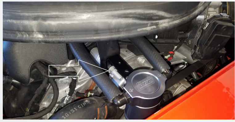
Remove the nut from the stud on the front of the engine install the BBk oil separator bracket onto the stud and reinstall the nut and tighten it down.