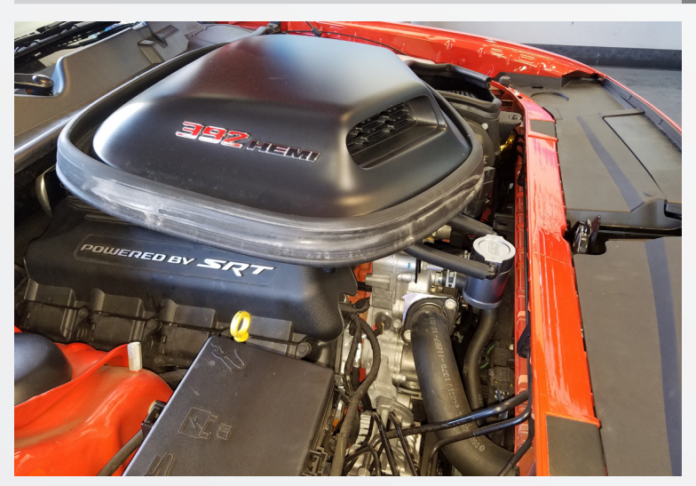
Tighten down all hardware and clamps, reinstall shaker if equipped, reconnect the negative battery terminal.