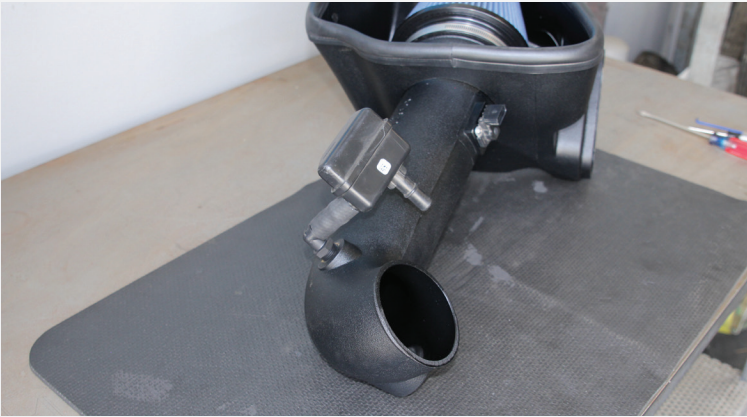
See photo to double check correct installation of vacuum box.