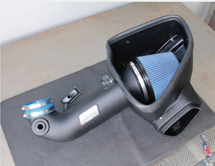
Install the Blue BBK Silicone coupler and clamps as shown – this photo now shows the correct installation of all parts onto the BBK cold air kit.