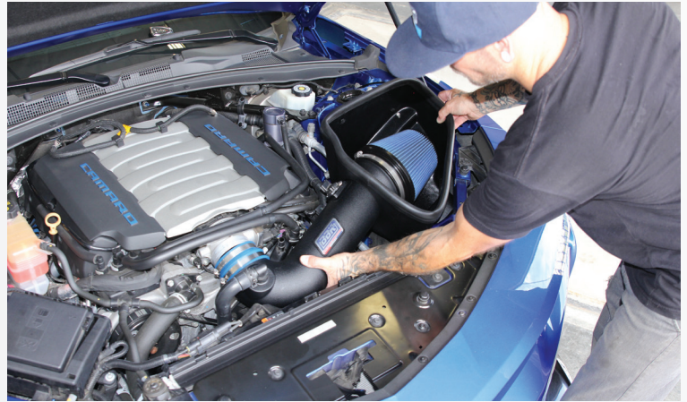
Now its time to install the complete BBK Cold air assembly onto the vehicle