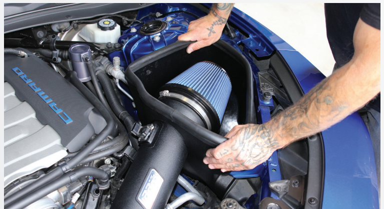
Start by positioning the assembly as shown in photo 27 – Now locate the metal locater pins on the BBK airbox and locate the Black OEM grommets – when in position over each other – push down to engage and snap into position – locate the factory air inlet tube in the lower corner of the fender well and massage into position over the BBK airbox to allow the flow of cold air directly into the BBK airbox.