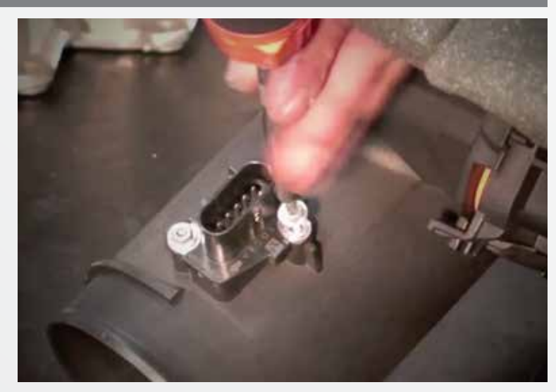
Remove mass air sensor from the stock inlet tube and install it into the aluminum mounting Block, on the BBK inlet tube with supplied screws.