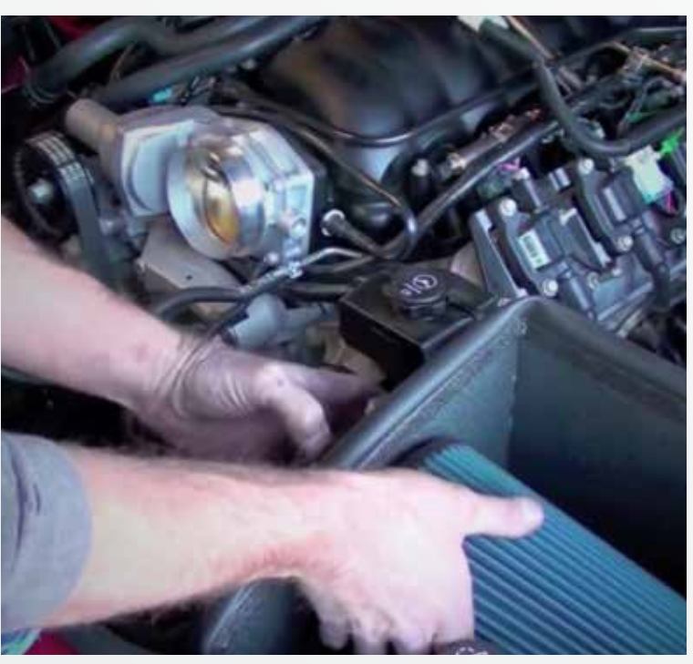
Position inlet tube and filter for best fit and tighten clamps on inlet tube and filter.