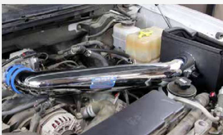
Install the blue BBK Coupler and BBK Intake Tube to the throttle body.