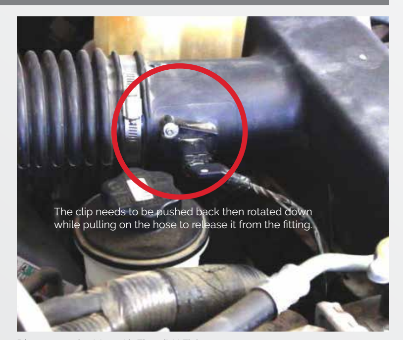
Disconnect the Mass Air Flow (MAF) Sensor.