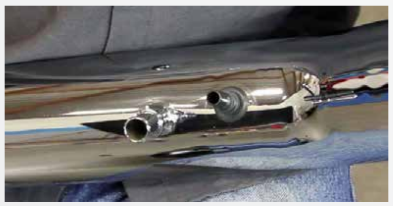
Install the supplied rubber grommet and straight fitting into the BBK Cold Air Tube.