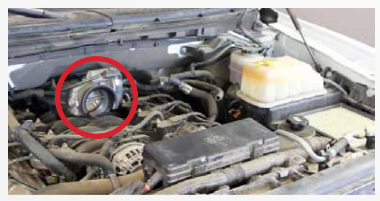
Unclip the three clips at the air box and remove the entire system out of the vehicle.

NOTE! The rubber coupler also needs to be removed from the throttle body.