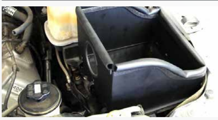
Place the cold air shield into the vehicle on the bottom half of the factory air box and use the three original clamps to secure the shield.