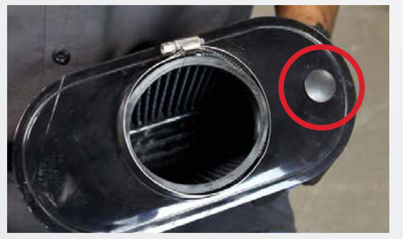
Install the sponge trimming onto the BBK Cold Air Intake shield and install the supplied plug into the BBK Air Filter.