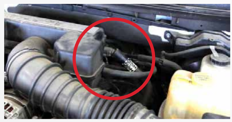
Remove the two vent hoses going into the factory intake system.