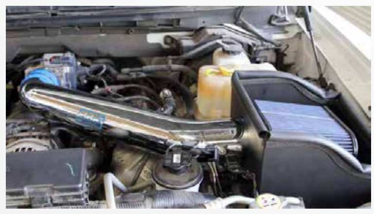
Install the supplied Air Filter, plug in the MAF Sensor and be sure all the clamps are tight.