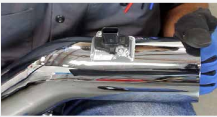
Remove the MAF Sensor from the stock intake system using a T-20 Torx and install it into the BBK Cold Air Tube using the supplied hardware.

NOTE! The Air Flow of the sensor needs to be going towards the throttle body, the sensor should only fit one way because of the stagger in the hole pattern.