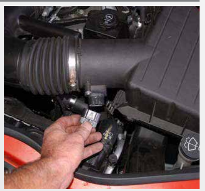
Disconnect Mass Air Sensor plug.