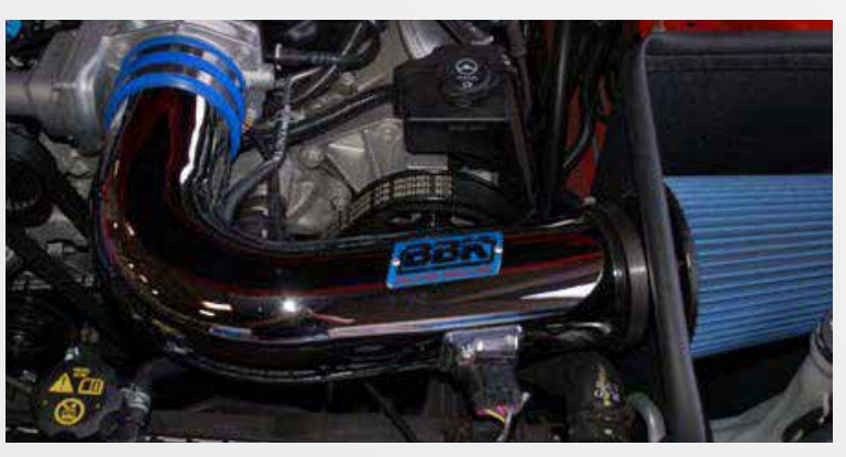
Set the filter into the filter shield and install the chrome inlet tube into the hole in the shield and onto the throttle body. Position filter on the end of the inlet tube. The filter clamp should be on the engine side of the filter shield. Tighten clamps at throttle body and filter.