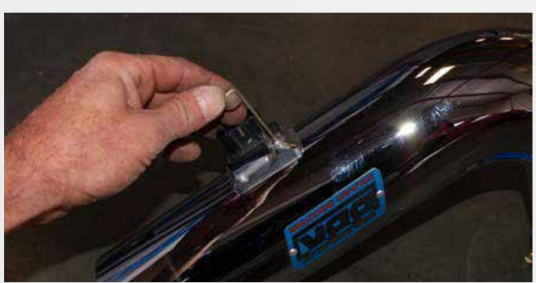
Install Mass Air sensor into the BBK inlet tube at the aluminum mount. Use the supplied Allen screws.