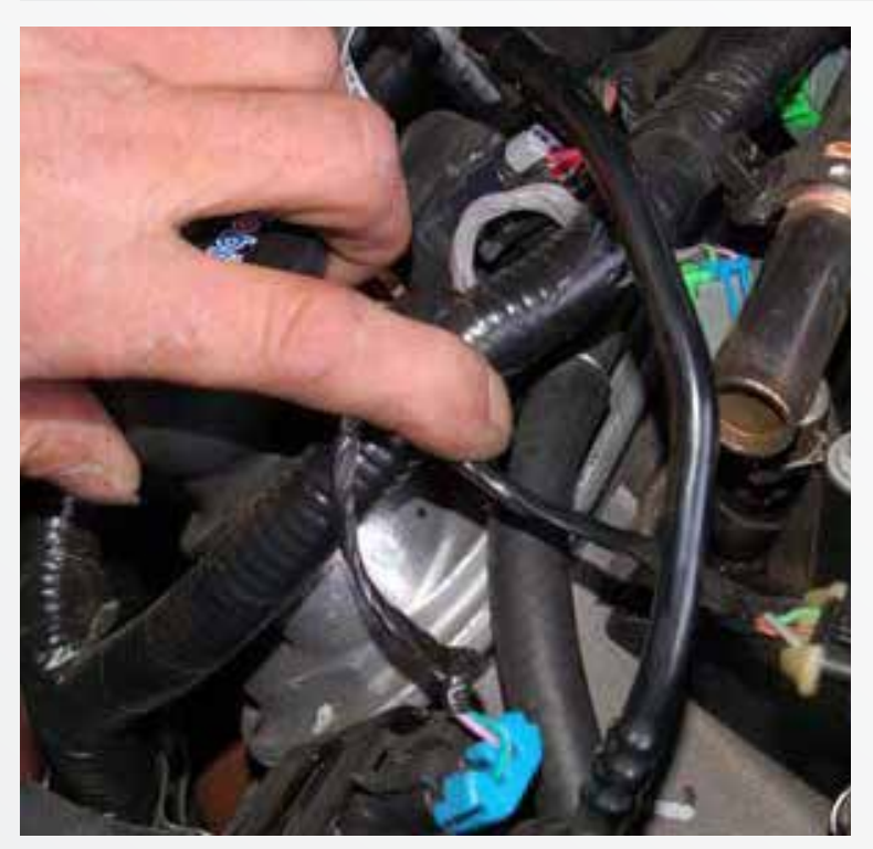
Route breather hose straight back under the throttle body and away from the idler pulley. Connect the hose to the steel breather line you disconnected the stock one from.