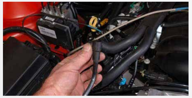
Loosen clamp on air inlet tube at throttle body. Disconnect plastic breather hose from tube at passenger side valve cover. Remove two nuts that secure the air box. Remove inlet tube and air box.