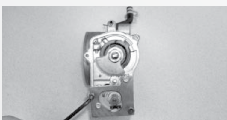
Using the puller tool remove the motor.

NOTE To use the puller; lay it flat over the top of the motor. Put the self-tapping screws through the small puller holes and tighten them with a oʻisocket into the small holes on top of the motor until the screw heads touch the puller. Insert the 4mm Allen heads into the threaded holes on the puller and tighten them evenly against the throttle body. This will pull the motor straight up and out. The BBK throttle body is designed to accept the motor with or without the circular clip.