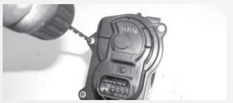
Using a drill with a 3/16 bit CAREFULLY drill out the rivets that attach the throttle body motor housing to the throttle body.