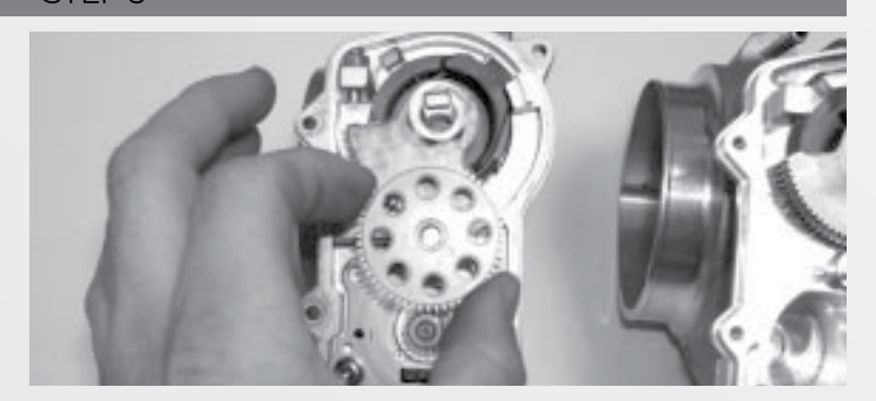
Remove the round idler gear from the throttle body.

NOTE Rotation orientation is not critical on assembly.