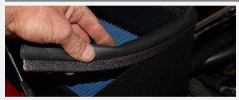
Install sponge seal to top of air filter shield. Trim off extra.