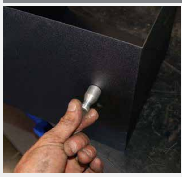
Install the supplied aluminum pins to the bottom of the air shield using the supplied screws.