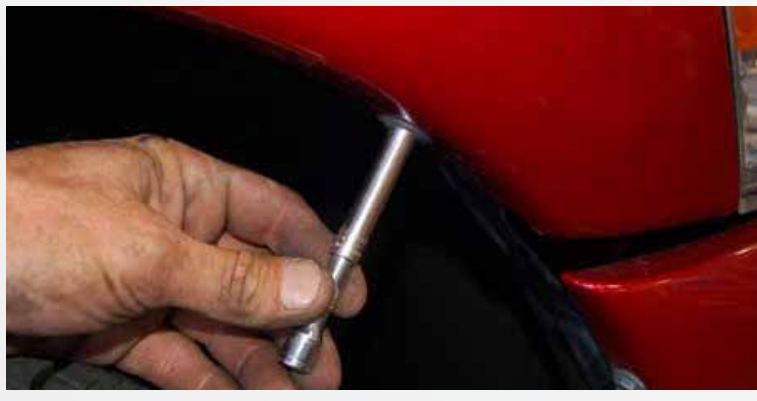
Remove the seven (7) inner fender screws from under the fender.