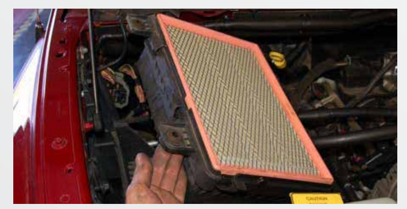
Loosen the hose clamp on the inlet hose where it connects to the decorative plenum. Release clamps on air-box lid and remove lid and inlet hose. Remove air-box bottom and Filter.