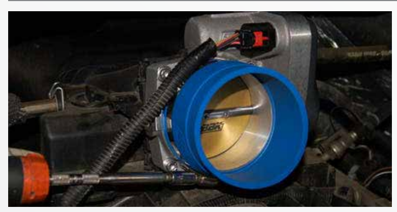
Install the supplied blue rubber hose coupler onto the throttle body. Install the clamps and Tighten the one on the throttle body.