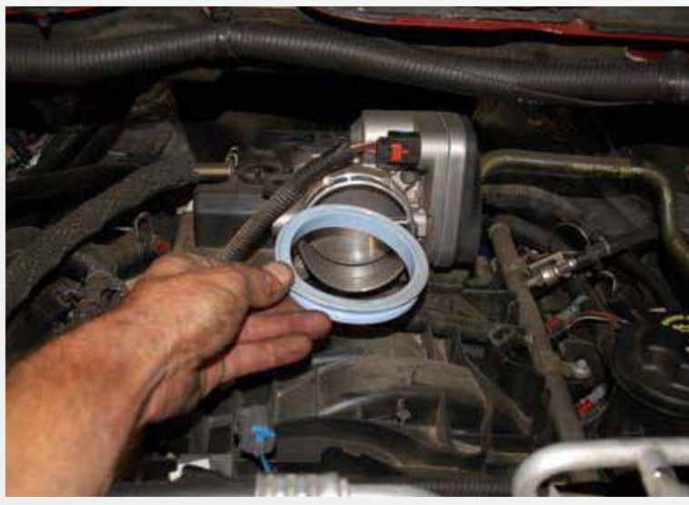
Loosen the two bolts that hold the plenum to the intake manifold. Remove plenum. Remove rubber seal from throttle body.