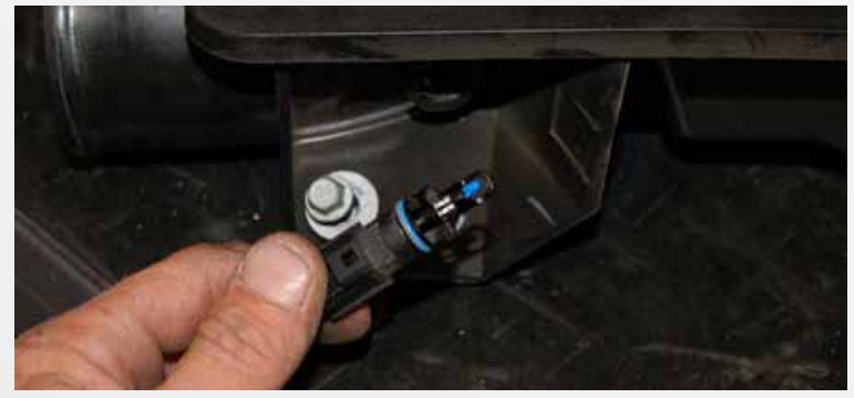
Unplug Intake Air Temp Sensor. Its located in the front of the decorative plenum box, just to the right of the inlet hose connection. Turn sensor to the left to unlock and remove.