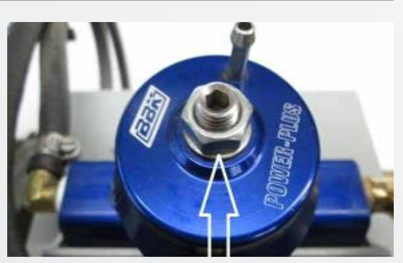
Loosen the lock-nut on the top of the fuel regulator.