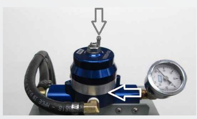
Now that the fuel system has been pressurized it is a good time to check for leaks around the BBK Fuel Regulator

NOTE: BE SURE TO CHECK THAT THERE IS NO FUEL COMING OUT OF THE VACUUM PORT ON THE TOP OF THE FUEL REGULATOR ALSO CHECK AROUND THE BASE OF THE FUEL REGULATOR