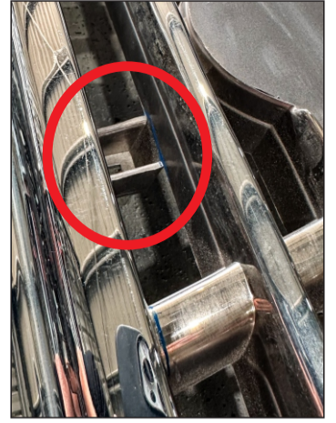
Check for factory mounts and cut around them (You need them to hold the grille on the vehicle)