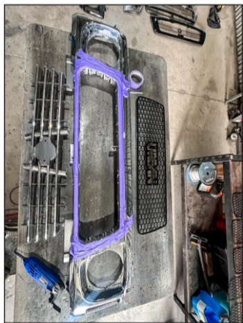
Remove the inside and your grille should look like this