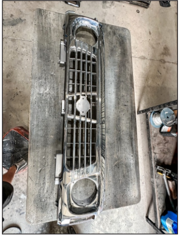
Remove Factory Grille From Vehicle