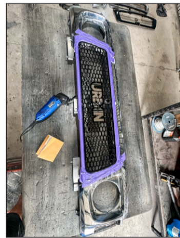
Place Grille Insert into Factory Grille and check fitment