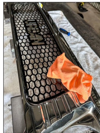
Flip grille over and check mounting depth is even