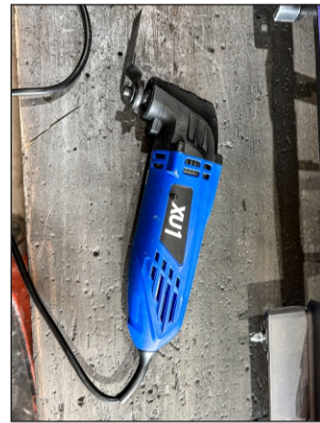
Grab your cutting tool A vibrating multi tool is the quickest and cleanest tool