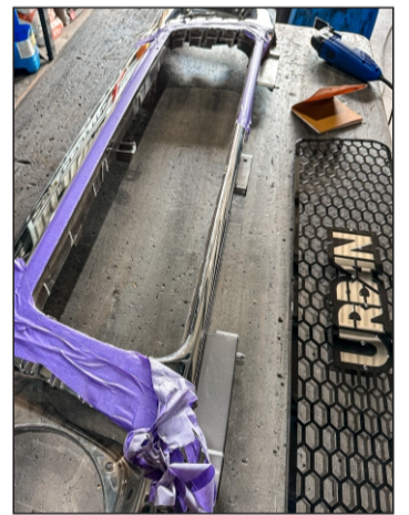
If the Grille Insert fits correctly remove the masking tape