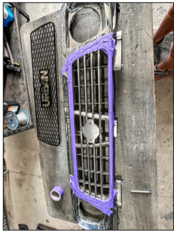
Grille will look like this Note: Some grilles have multiple parts and you might be able to remove this to get a cleaner cut