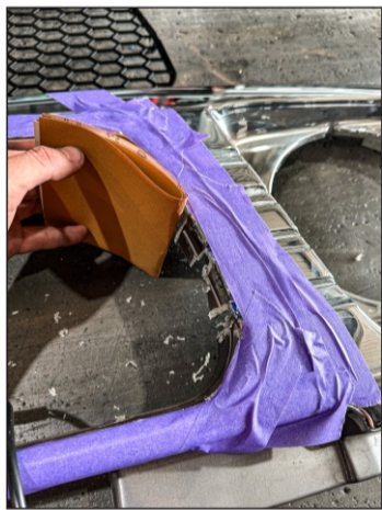
Sand all rough edges till smooth