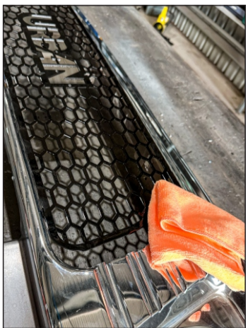
Wipe off all marks and prepare to install grille Note: This is when you should paint your factory grille if desired