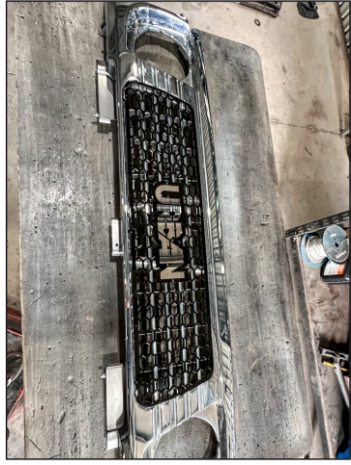
Place Grille Insert onto Factory Grille