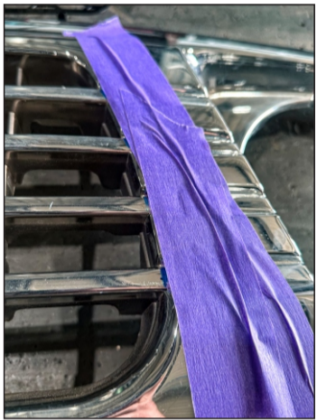
Place masking tape around marks so you do not scratch the factory grille