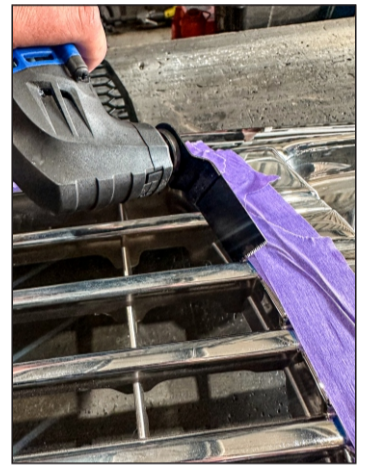
Start cutting the factory grille being careful not to scratch it