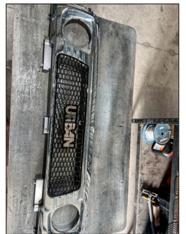
Your grille insert is now fitted and ready to be reinstalled on the vehicle