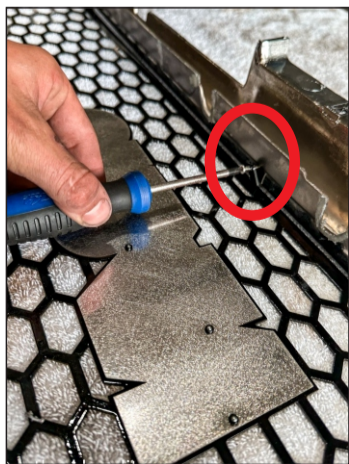
Hold grille at desired mounting depth and screw in the stainless screws where required