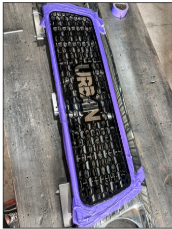
Place the grille insert on top and check the cut lines