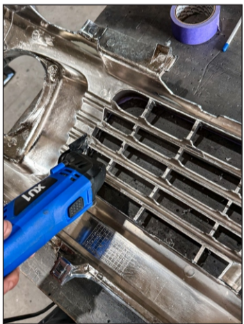
You may need to flip it over for some parts