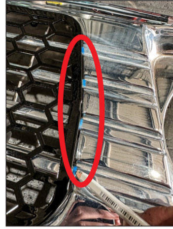
Mark out the parts of factory grille that need to be removed