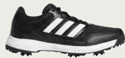
Adidas Tech Response 2.0 Golf Shoe

A 20% additional inventory will be shipped to allow for all participants. Individuals unable to be fitted can be accommodated through drop shipments. Please return excess inventory after the event.