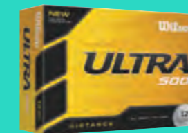
Wilson Ultra Distance