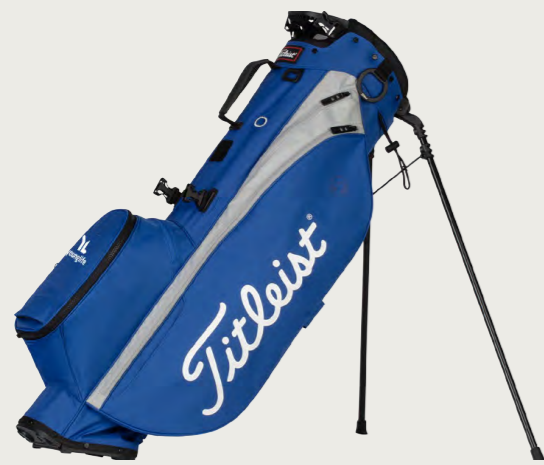
Titleist® Players 4 Carry Bag

Select a bag style, then choose which colors you want to display. Bags will be drop shipped to each player's address after the event.