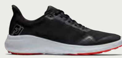
Footjoy Flex Golf Shoe