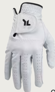
Callaway Opti Flex Glove