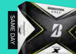
Bridgestone Tour BX