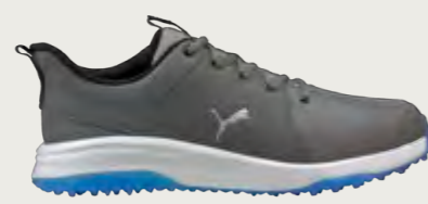
Puma GripFusion 3.0 Golf Shoe