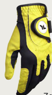
Zero Friction Men's Golf Glove