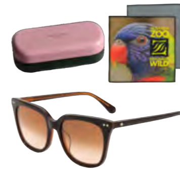
Kate Spade Giana Sunglasses Kit