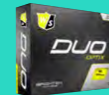
Wilson Staff Duo Soft Optix