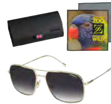
Carrera 247 Sunglasses Kit