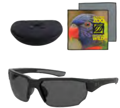
Under Armour Blitzing Sunglasses Kit