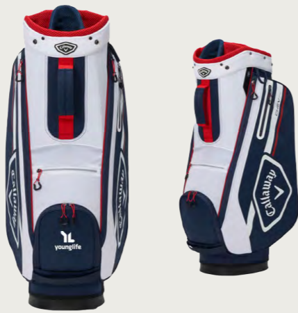
Callaway Chev Stand Bag