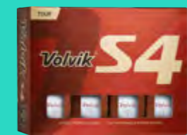
Volvik S4 Urethane