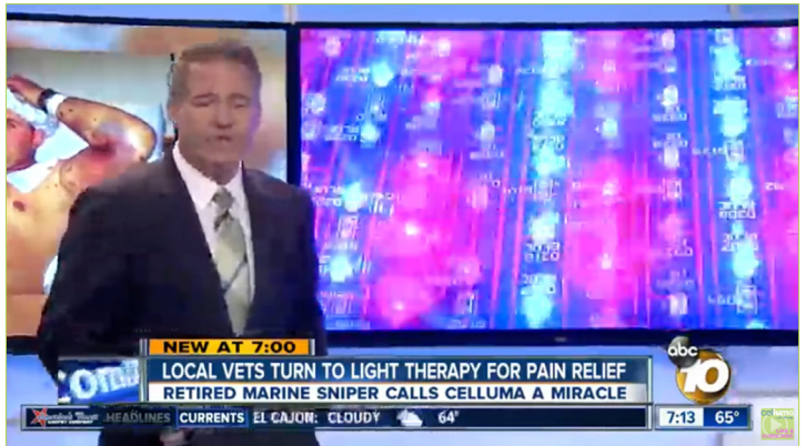
2018 SAN DIEGO ABC NEWS