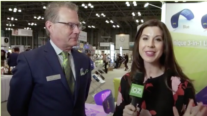
2018-APRIL DR. OZ DIGITAL