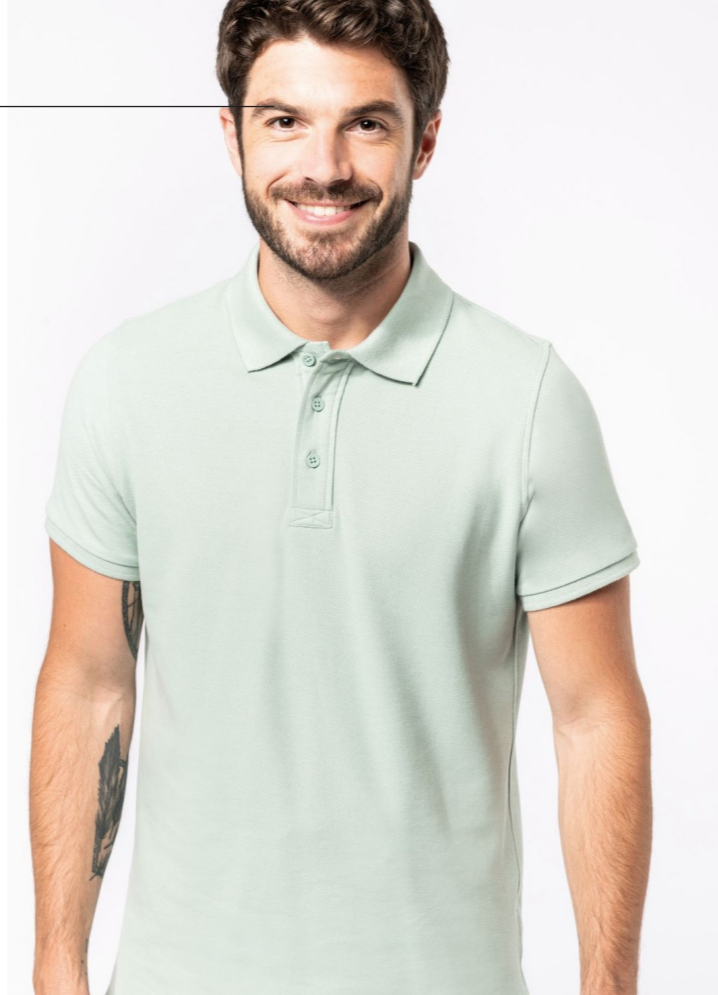
Vogue men's polo K209