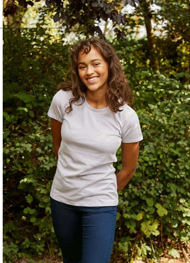
Ladies fitted t-shirt 081001