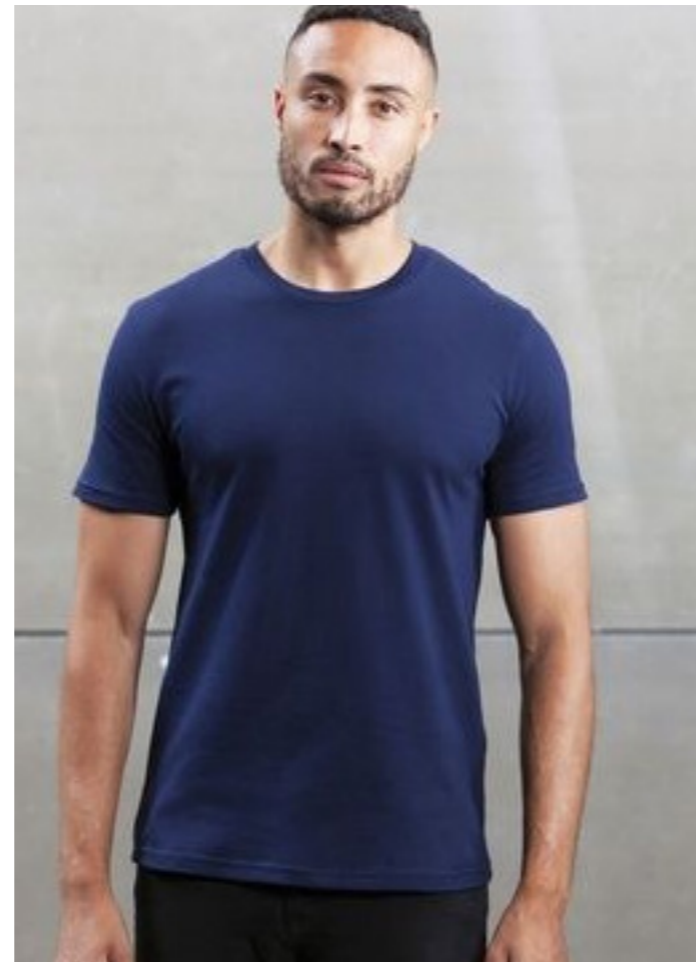
Essential men's and ladies t-shirts M01 | M02