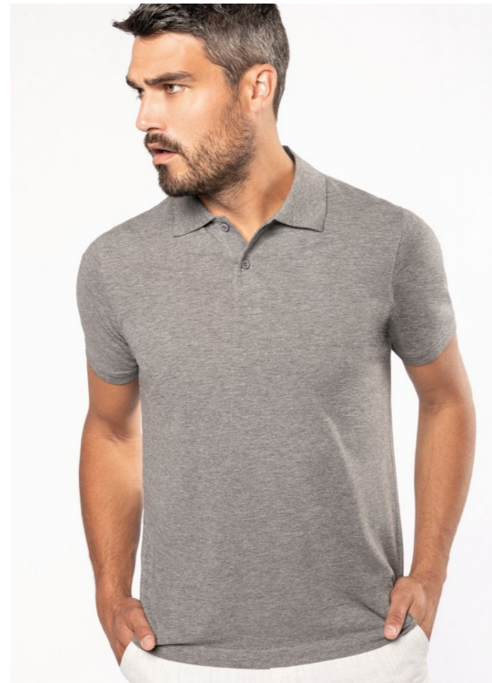
Vision men's and ladies polos K2025 | K2026