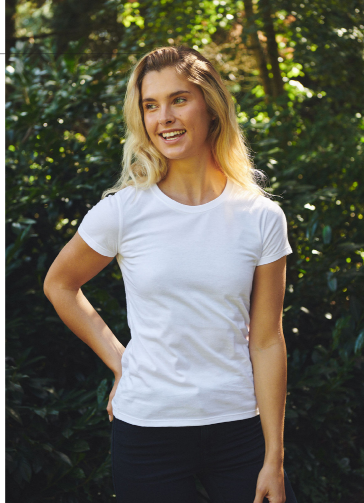
Ladies classic t-shirt 080001