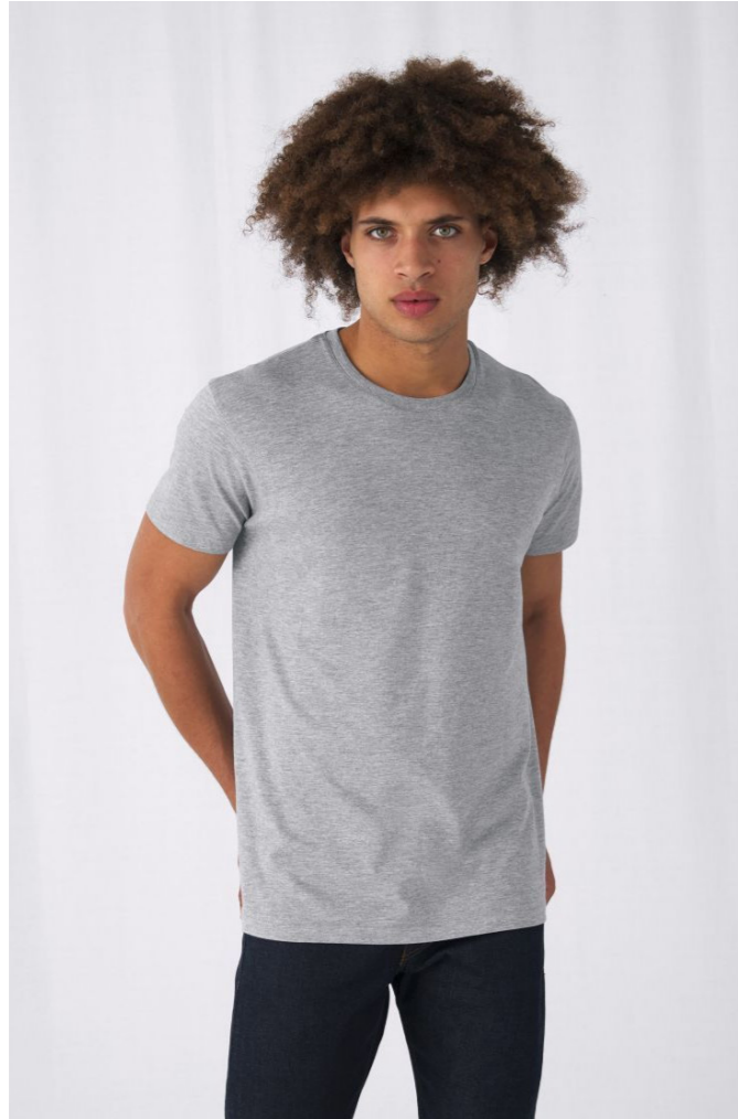
Inspire men's t-shirt TU01B