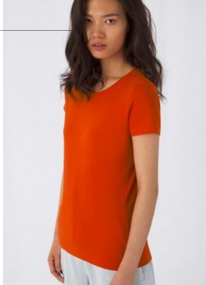
Inspire women's t-shirt TW049