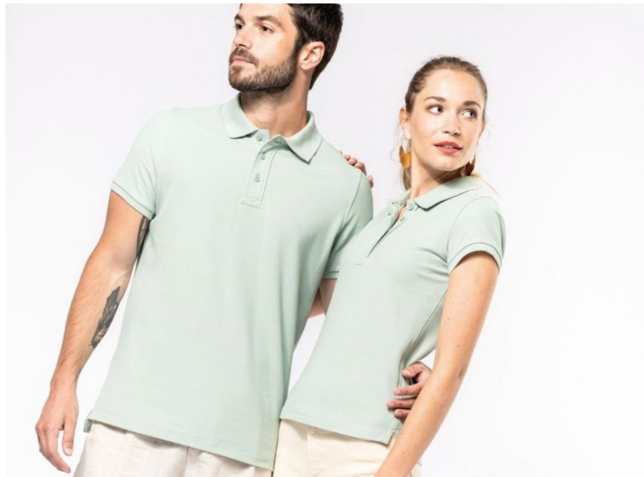
Vogue women's polo K210