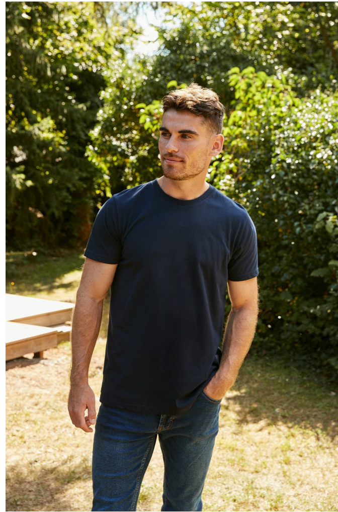
Men's fitted t-shirt 061001