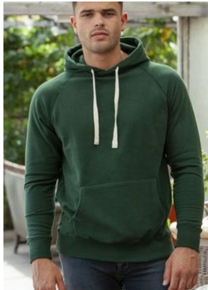
Essential unisex hoodies M73 | M84, available with or without zipper