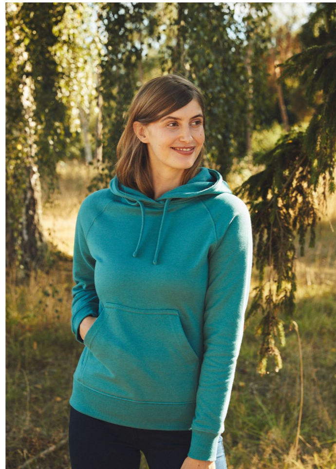
Ladies and men's hoodies 083101 | 063101 - available with or without zipper

More than 22 colour options (long-sleeve) / More than 30 colour options (hoodie)