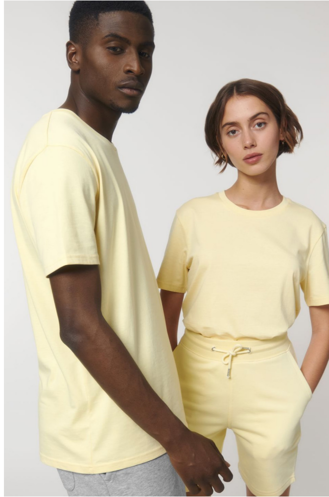
Creator unisex t-shirt STTU755