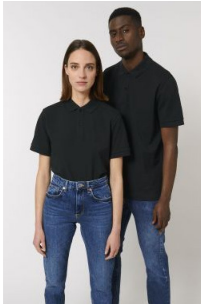
Rocker unisex polo STPU331