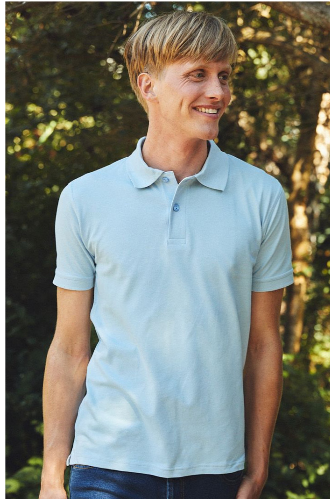
Classic fitted men's polo 020080