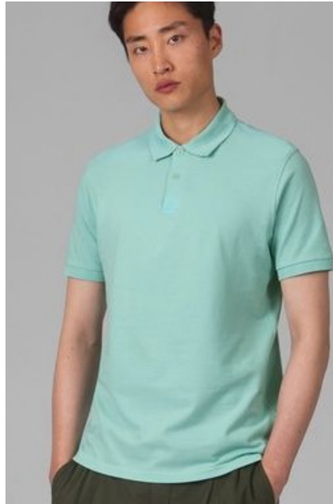
Inspire men's polo PM430