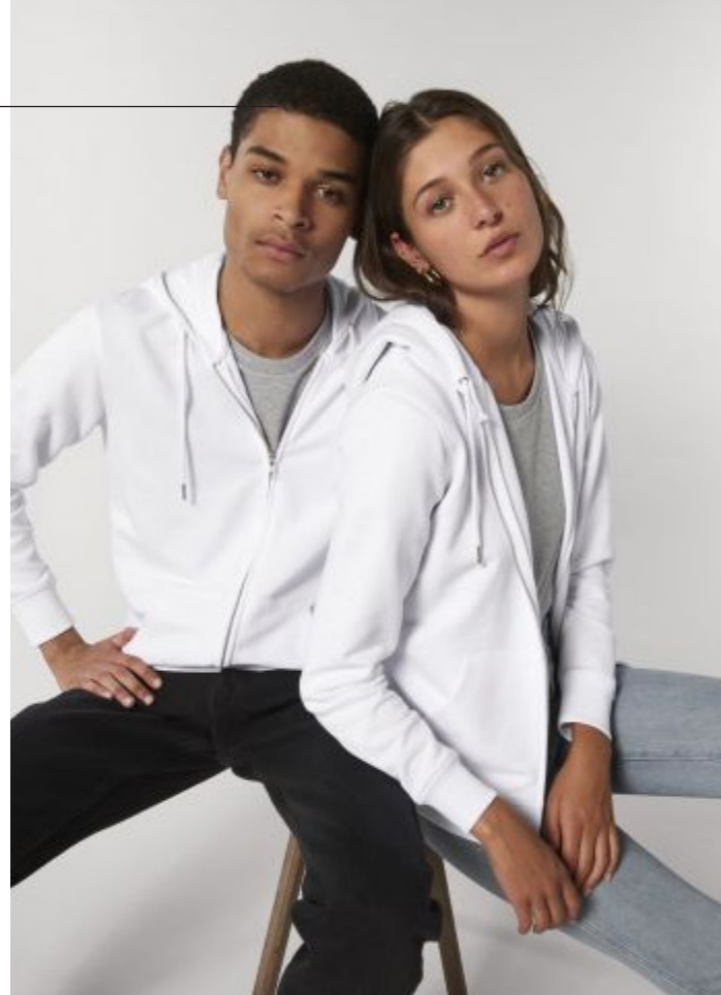
Connector unisex zipper hoodie STSU8z0