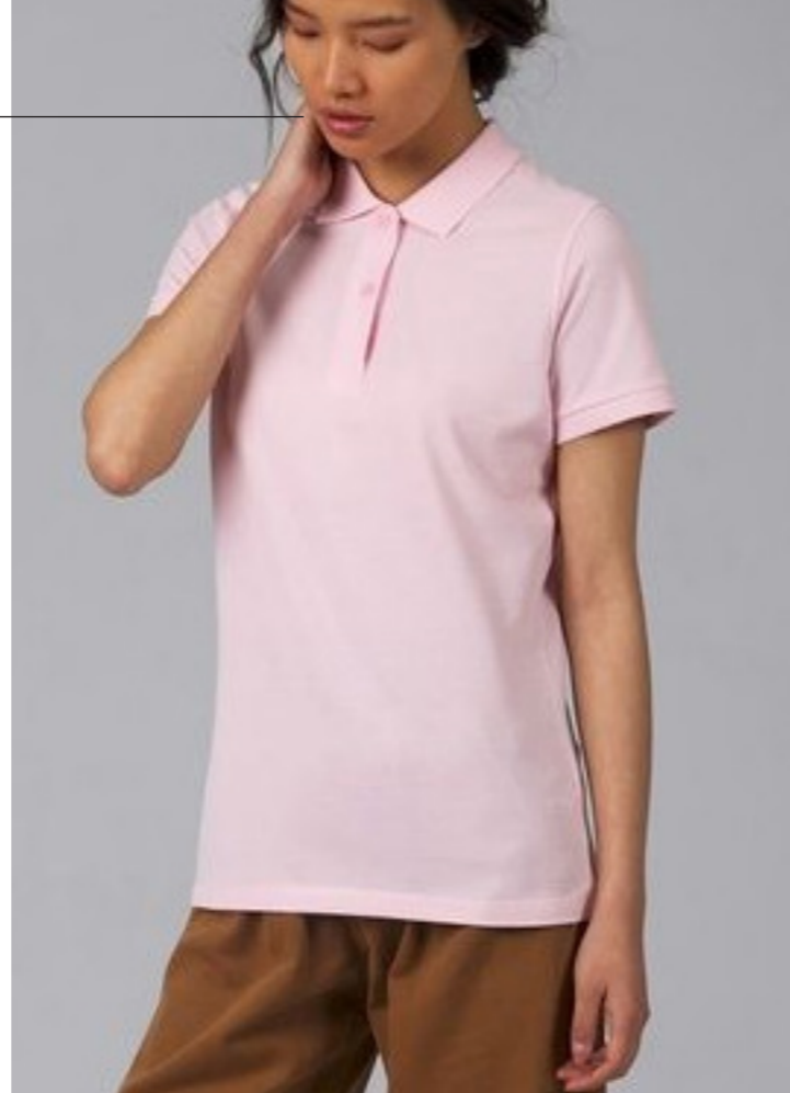
Inspire women's polo PW440