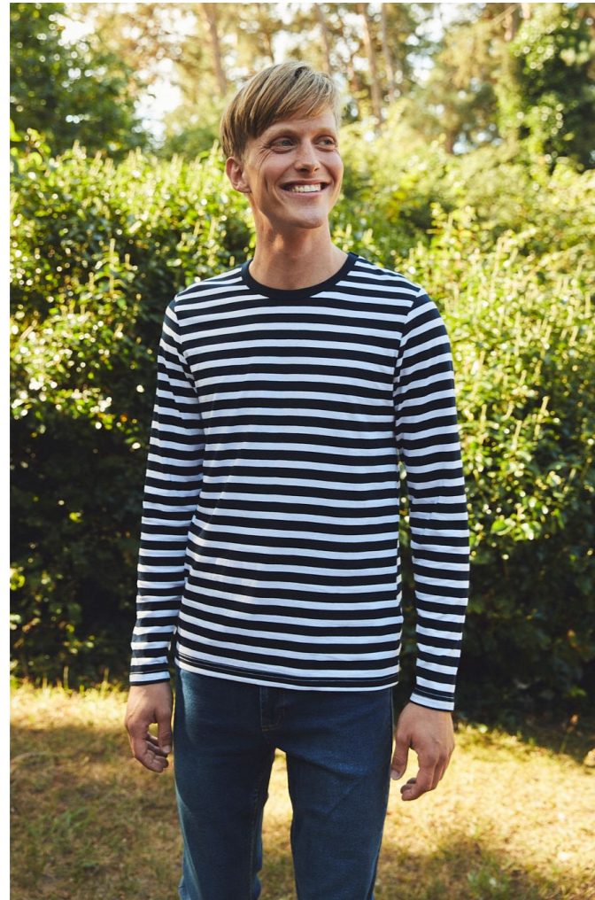
Men's long-sleeve t-shirt 061050