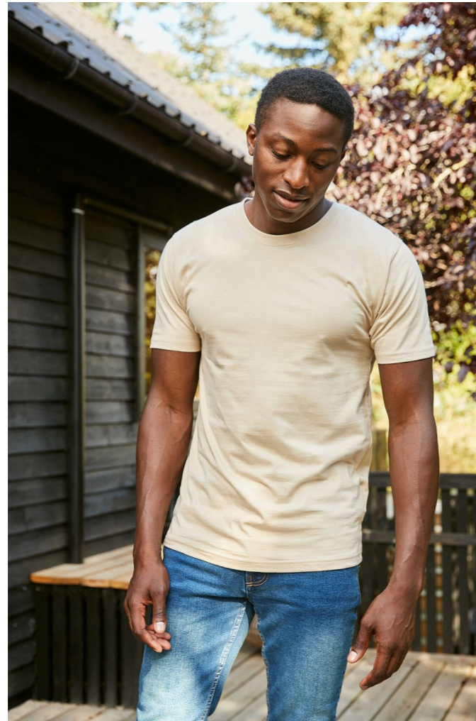
Men's classic t-shirt 060001