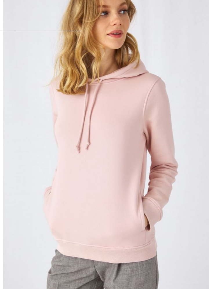
Inspire women's hoodie WW34B