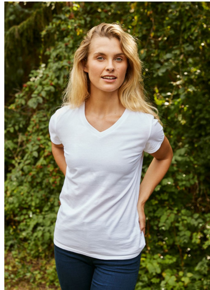
Ladies and men's fitted v-neck t-shirts 081005 | 061005