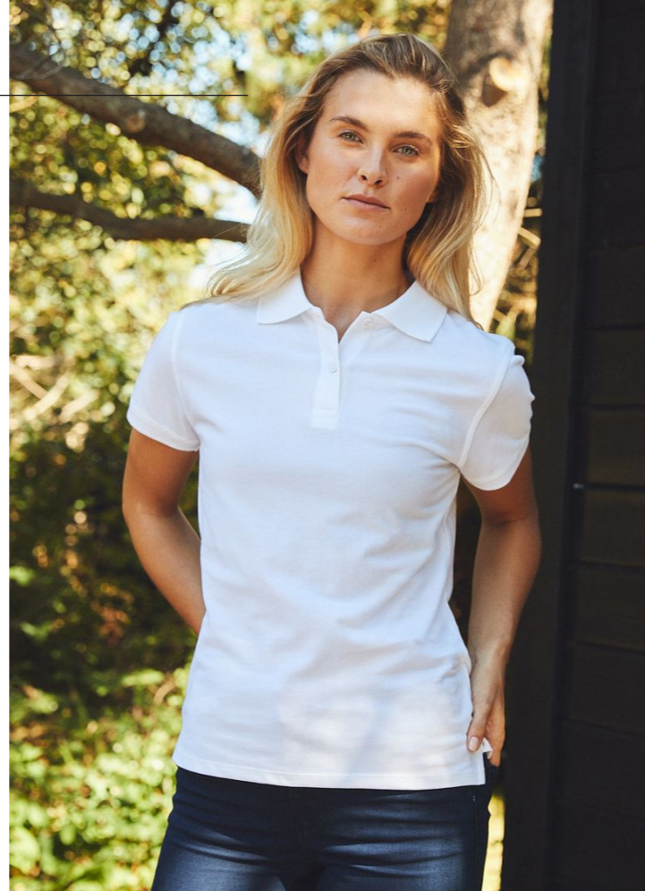
Classic fitted women's polo 022980