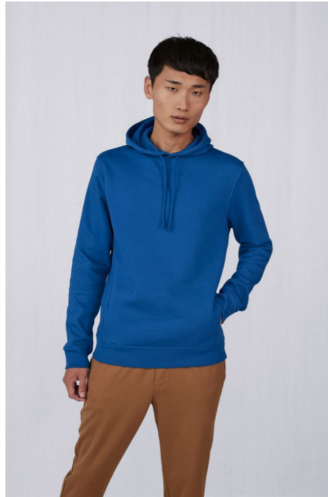
Inspire men's hoodie WU33B