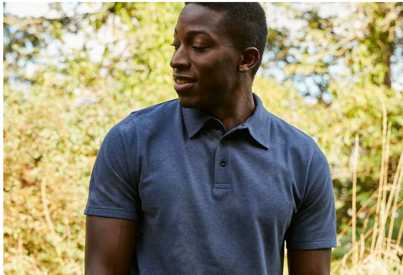
Recycled cotton polo - available in men and women C20090

More than 24 colour options (non recycled) / 3 colors available for recycled options