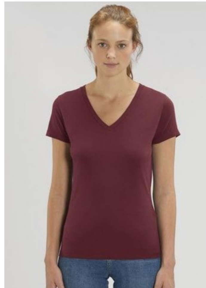
Evoke men's and ladies v-neck t-shirts STTM562 | STTW023