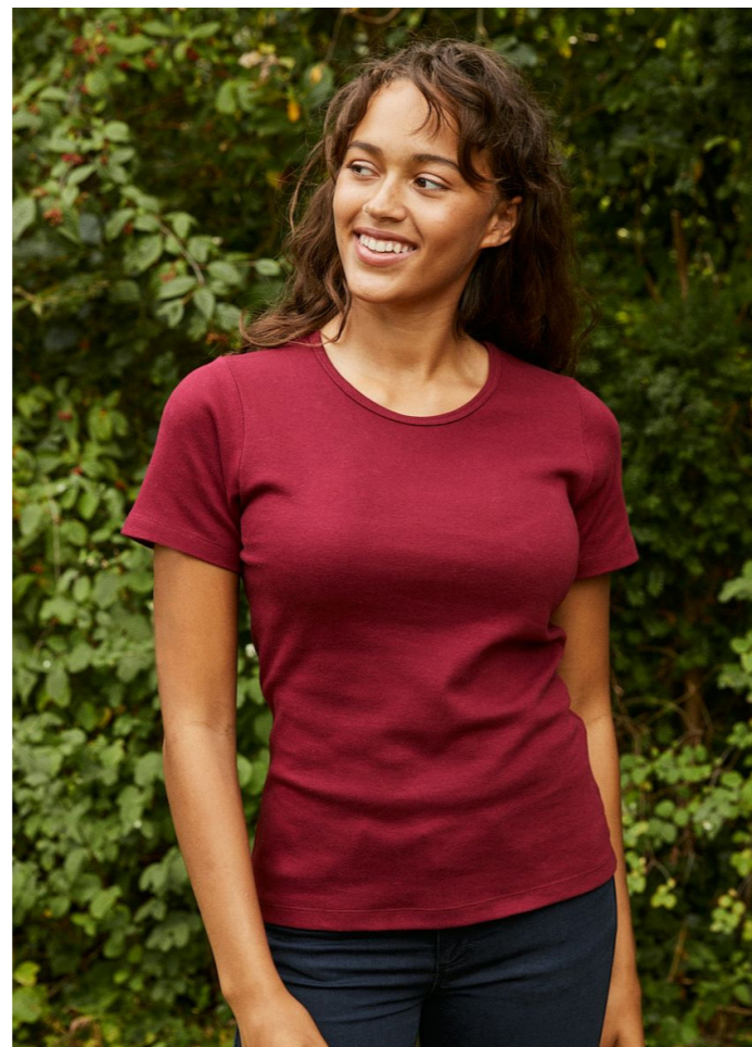
Ladies and men's interlock t-shirts 081029 | 061005

More than 24 colour options (standard) / 6 colors available for interlock options