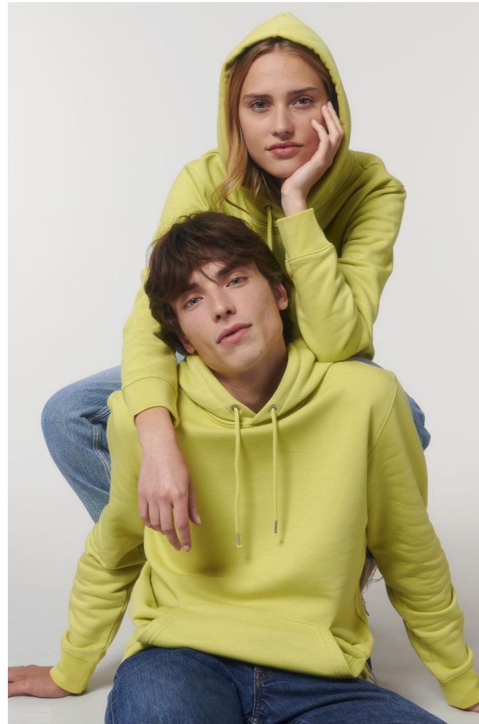
Cruiser unisex heavy hoodie STSU8z2