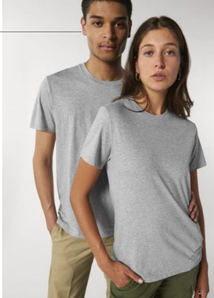
Rocker essential unisex t-shirt STTU758