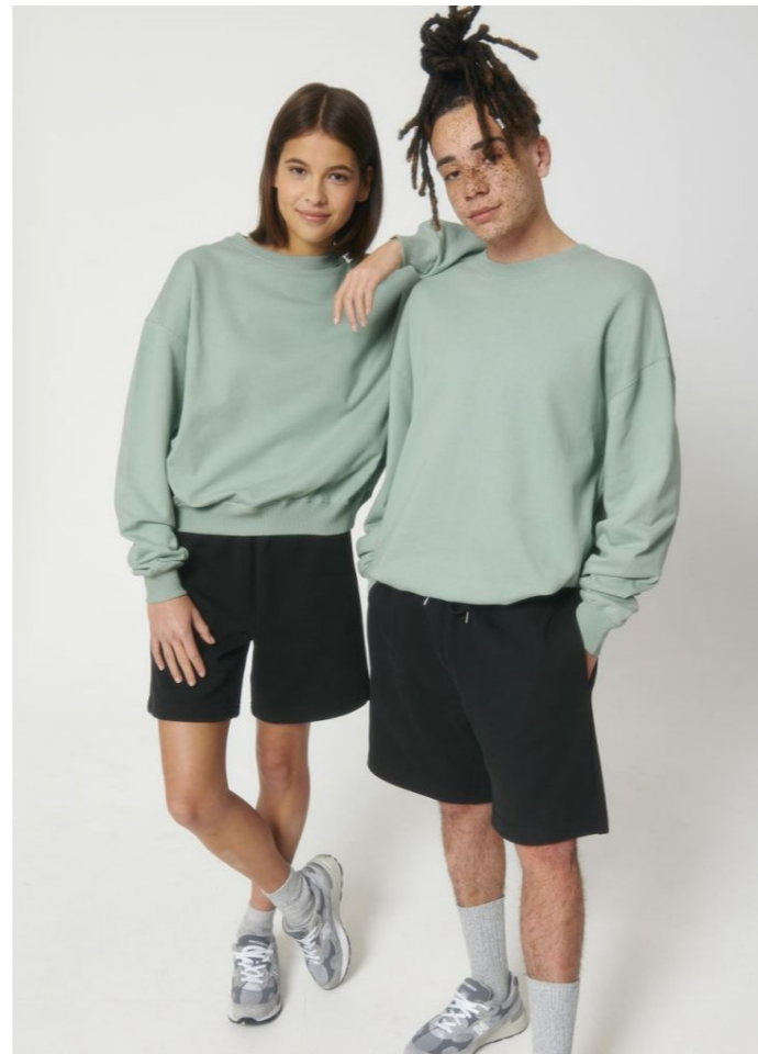
Boxer unisex sweatshirt STSU798 | Hunter unisex lightweight sweatshirt STSU011

The classic t-shirt, comes in both a standard fabric weight and a heavier interlock. The cut is designed for comfort above all, relaxed where it needs to be.