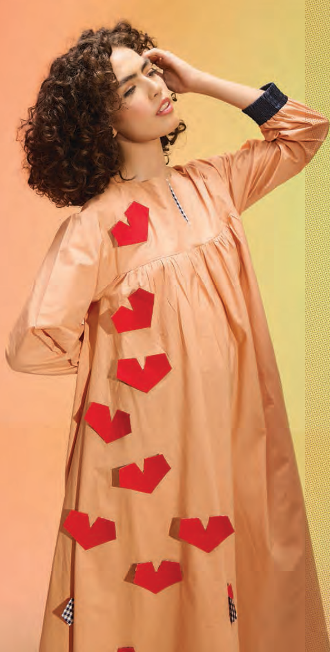
LIVELY POPLIN DRESS WITH HANDMADE 3D HEART PATCH