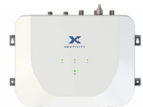
CEL-FI GO G43

CEL-FI GO G43 can be set up and improve in-building connectivity within hours. The system also offers remote monitoring via the Nextivity WAVE Portal, which provides real-time system performance data.