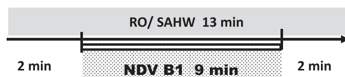
Fig. 1. A scheme of the spraying duration of ND vaccine virus and SAHW/RO. SAHW or RO water were sprayed for 13 min (2 min before and 2 min after NDV spraying). Within 9 min, 25 doses of ND vaccine were sprayed.

In vitro experiment using virulent strain Sato. To confirm the virucidal efficacy of SAHW against the virulent strain Sato, 225 \mu\text{l} of SAHW containing 50 ppm chlorine was mixed with 50 \mu\text{l} of NDV strain Sato and kept for 5 sec. Then 225 \mu\text{l} of FBS was added to stop the activity of SAHW. The remaining virus was titrated on CK cells in a 96 microplate.