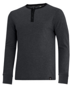
CHARCOAL HEATHER / BLACK