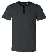
CHARCOAL HEATHER / BLACK