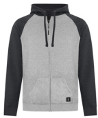
CHARCOAL HEATHER / ASH HEATHER