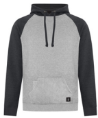
CHARCOAL HEATHER / ASH HEATHER