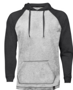
CHARCOAL HEATHER / ASH HEATHER