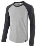
CHARCOAL HEATHER / ASH HEATHER