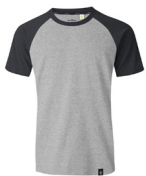
CHARCOAL HEATHER / ASH HEATHER