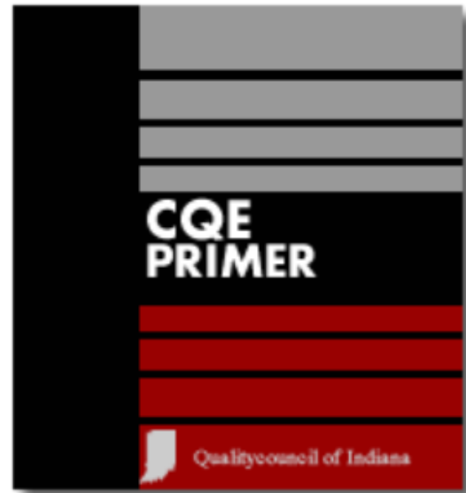
Certified Quality Engineer Primer Price: $85.00

ASQ BOK coverage: Quality Council of Indiana