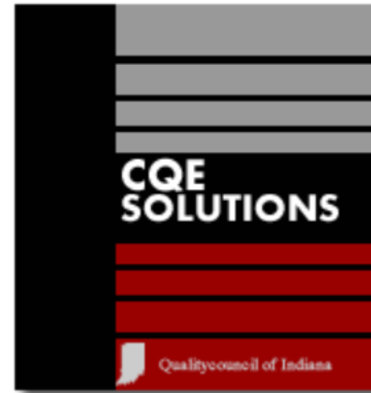
Certified Quality Engineer Solutions Price: $35.00