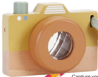
Capture young imaginations with Little Dutch's wooden camera with kaleidoscope lens, £9.99, from Mabel & Fox