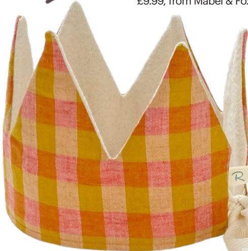
Runaround Retro's tie-up fabric crowns have beautiful vintage style, £24, the Country Living Marketplace. It's a dressing-up box essential or special birthday 'hat'