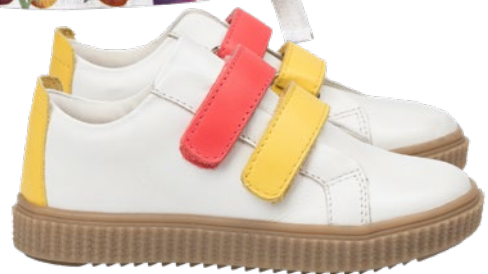
Pip & Henry's Velcro sneakers , made from leather offcuts, pop with neon colour, £65. They are podiatrist approved and if they can't be handed down when they no longer fit, there's £10 off the next order when using their recycling service