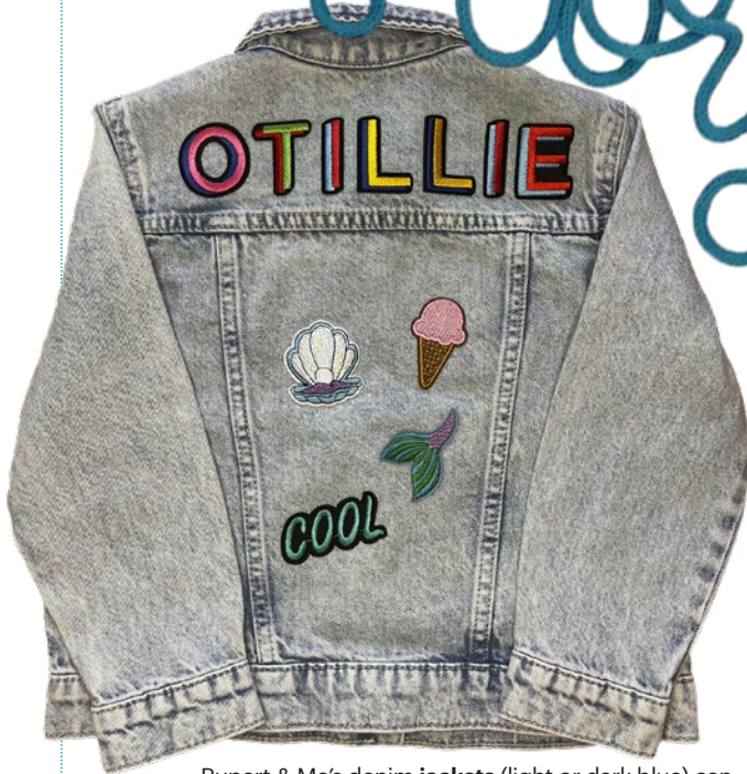
Rupert & Me's denim jackets (light or dark blue) can be decorated with four patches and a name, from £40, available for ages three to six months to ten years

Crafted from wire and cotton yarn in Scandi-inspired hues, Hey Kiddo Studio's inspiring words add playful decoration to a child's bedroom. This one is £38