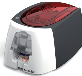
Badgy card printer