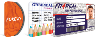
Online card template library