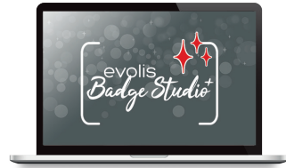
Evolis Badge Studio® card designer software