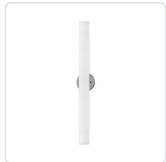
WS8332-BN Brushed Nickel