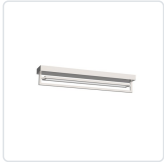
SF16230-BN Brushed Nickel