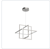
PD16320-BN Brushed Nickel