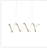
LP93742-AN Antique Brass