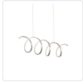
LP93742-AS Antique Silver