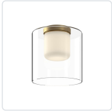
FM53509-BG/CL Brushed Gold/Clear