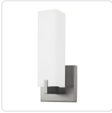
601485BN-LED Brushed Nickel