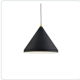
492824-BK/GD Black with Gold detail