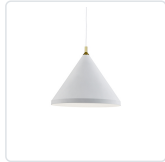
492824-WH/GD White with Gold detail