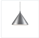
492824-BN/BK Brushed Nickel with Black detail