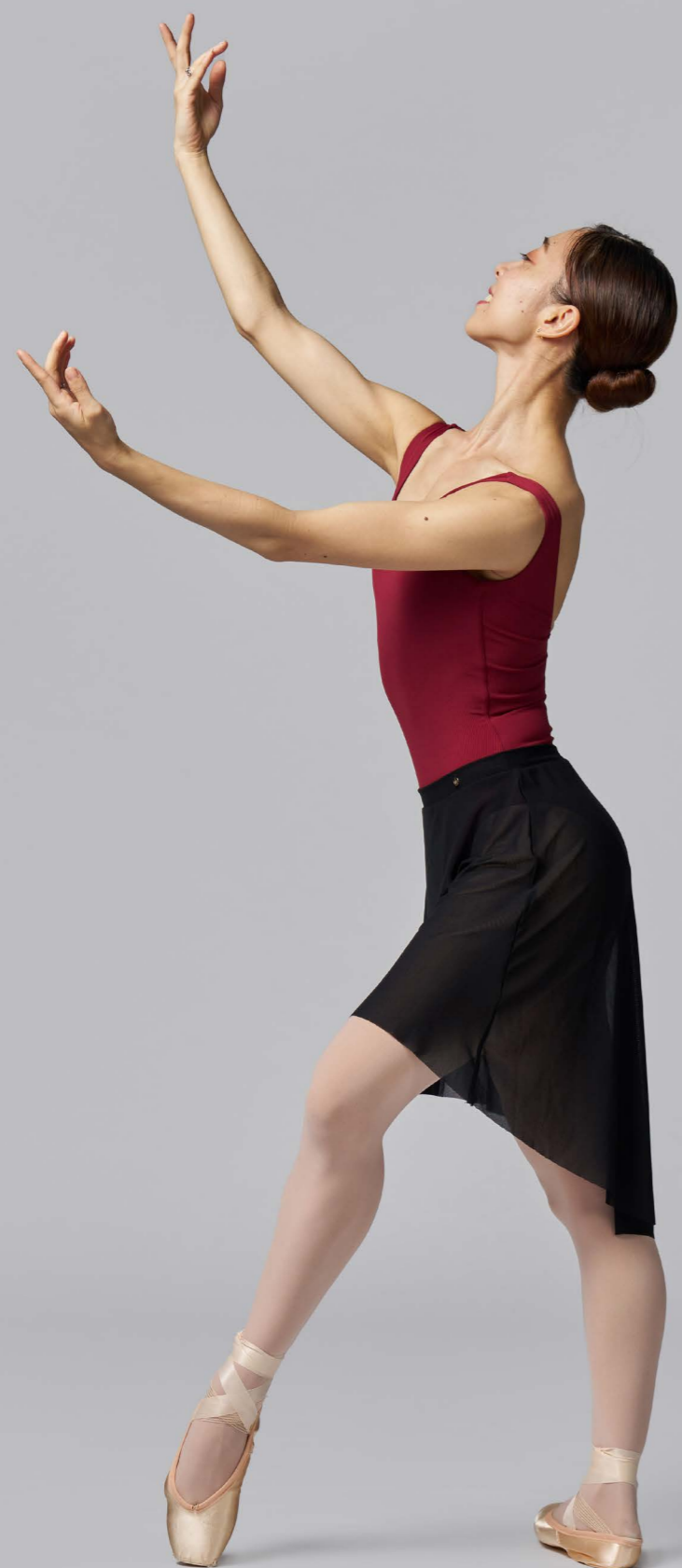
Adage High-Low Skirt