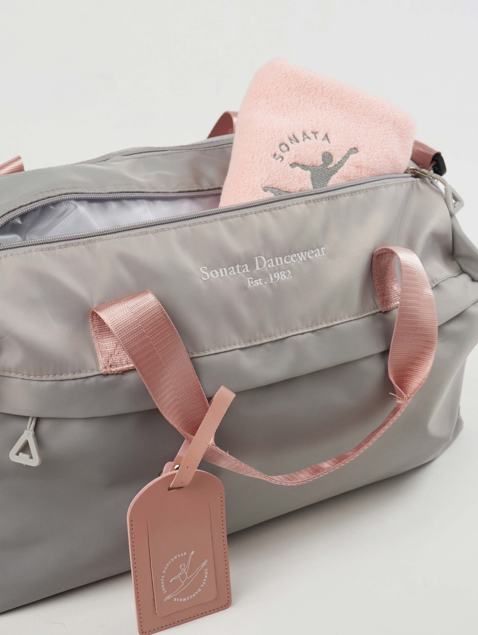
Everything Dance Bag Face Towel