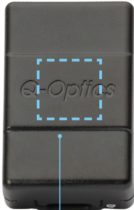
On / Off Touch Activation Area