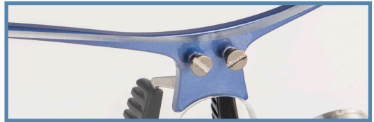
Mounting clip styles will vary

The Q-Optics Radiant™ Cordless Headlight mounts easily via the quick-disconnect mount enabling use with nearly all brands or styles of loupes and safety glasses.