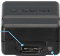
Power Supply USB-C Connection Interface

Each Q-Optics Radiant™ Cordless Headlight includes two intuitive battery pack units with an integrated touch control. Note the location and function of the interface.