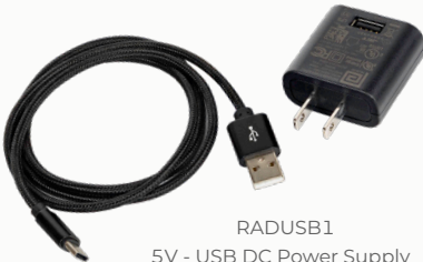
RADUSB1 5V - USB DC Power Supply