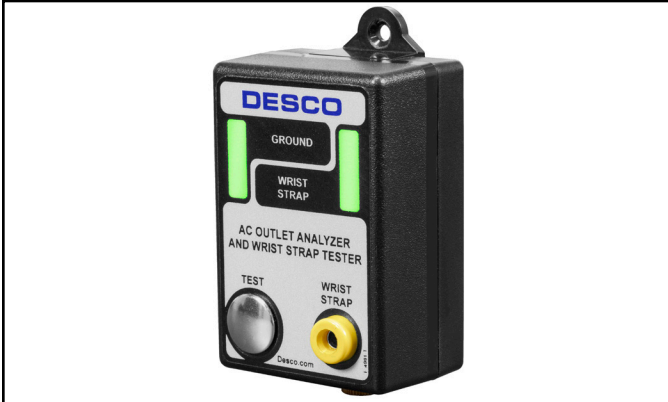
Figure 1. Desco 98133 AC Outlet Analyzer and Wrist Strap Tester