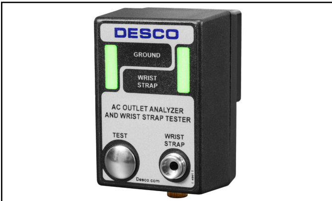
Figure 2. Desco 98134 AC Outlet Analyzer and Wrist Strap Tester

Use the AC Outlet Analyzer and Wrist Strap Tester to fulfill the S6.1 Section 6.3.1 requirement. “The hot, neutral, and equipment grounding conductor shall be verified to be in the proper wiring orientation in accordance with the National Electric Code (ANSI/NFPA-70).” (Grounding ANSI/ESD S6.1 section 6.3.1 Equipment Grounding Conductor)