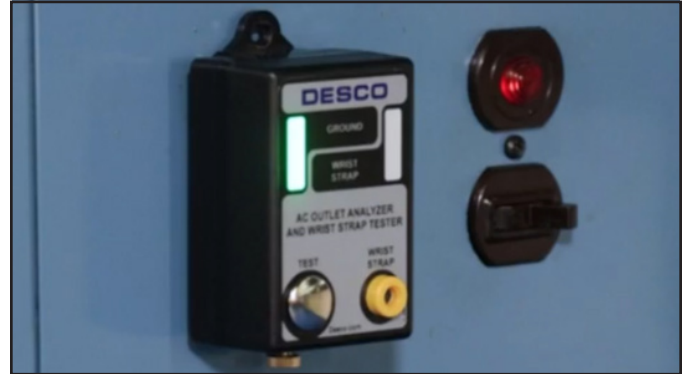
Figure 5. Verifying a properly wired AC outlet

The Ground LED will illuminate red and the audible alarm will sound if the outlet's wiring is incorrect or the path to equipment ground via the equipment grounding conductor is not intact.