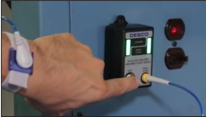
Figure 7. Performing a wrist strap test

If the test fails, check the wrist strap to ensure it is being worn correctly and/or needs to be replaced. Failures may also be caused by dry skin or minimal sweat layer. Apply an approved dissipative hand lotion such as Menda Reztore® ESD Hand Lotion to the wrist prior to use.