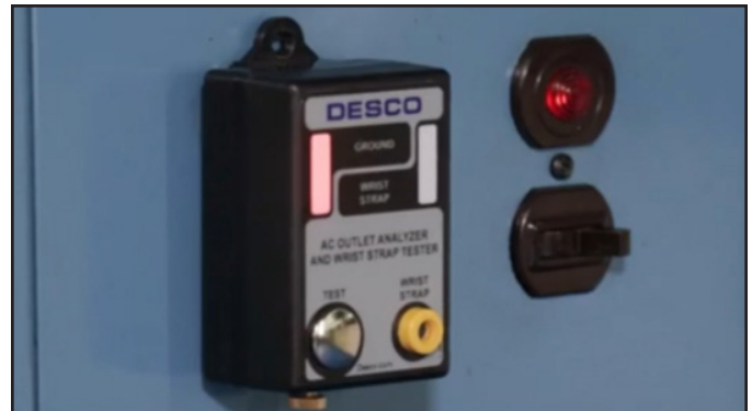
Figure 6. Verifying a properly wired AC outlet

The Ground LED will illuminate red and the audible alarm will sound if the outlet's wiring is incorrect or the path to equipment ground via the equipment grounding conductor is not intact.