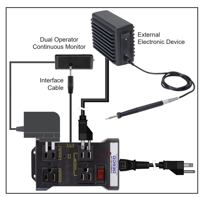
Figure 4. Installing the Power Relay with the 19655 Dual Operator Continuous Monitor

DESCO WEST - 3651 Walnut Avenue, Chino, CA 91710 • (909) 627-8178 DESCO EAST - One Colgate Way, Canton, MA 02021-1407 • (781) 821-8370 • Website: Desco.com