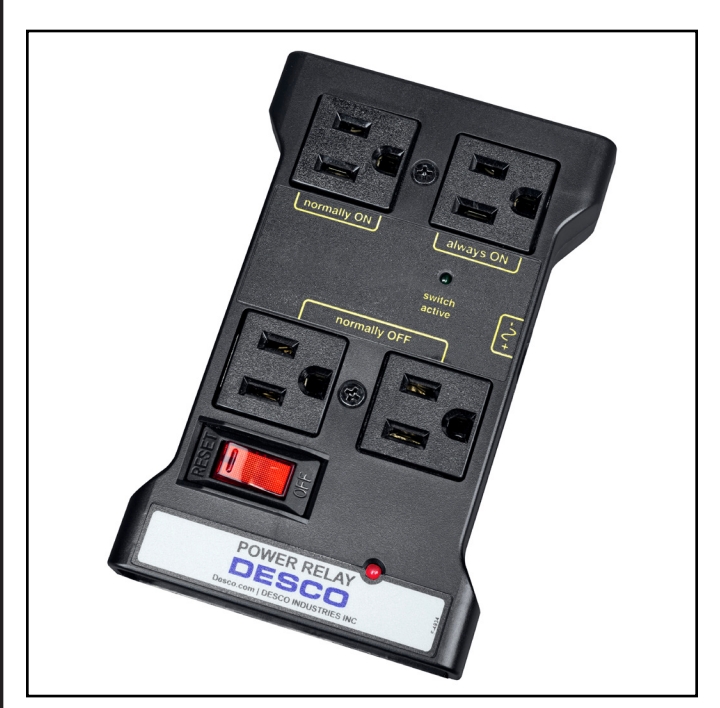
Figure 1. Desco 19333 Power Relay