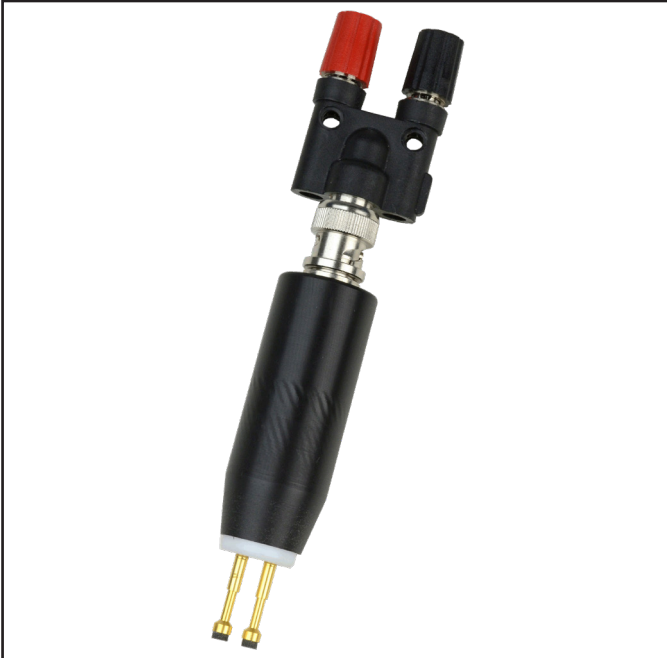
Figure 1. Desco 19297 Two-Point Resistance Probe