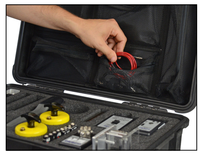
Figure 2. Using the ESD Survey Kit's lid organizer

https://www.esda.org/standards/esda-documents/