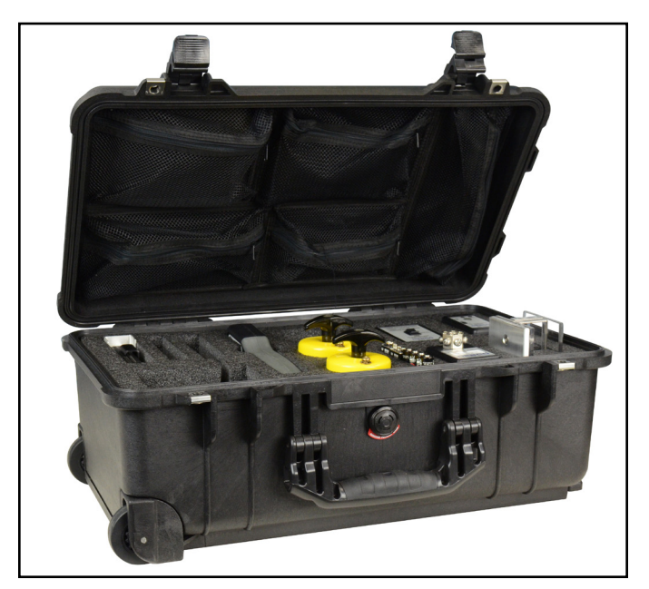
Figure 1. Desco 19790 ESD Survey Kit