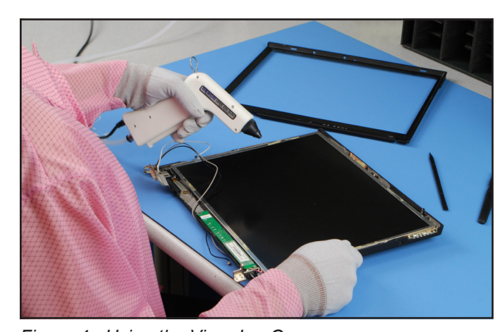
Figure 4. Using the Viper Ion Gun

DESCO WEST - 3651 Walnut Avenue, Chino, CA 91710 • (909) 627-8178 DESCO EAST - One Colgate Way, Canton, MA 02021-1407 • (781) 821-8370 • Website: Desco.com