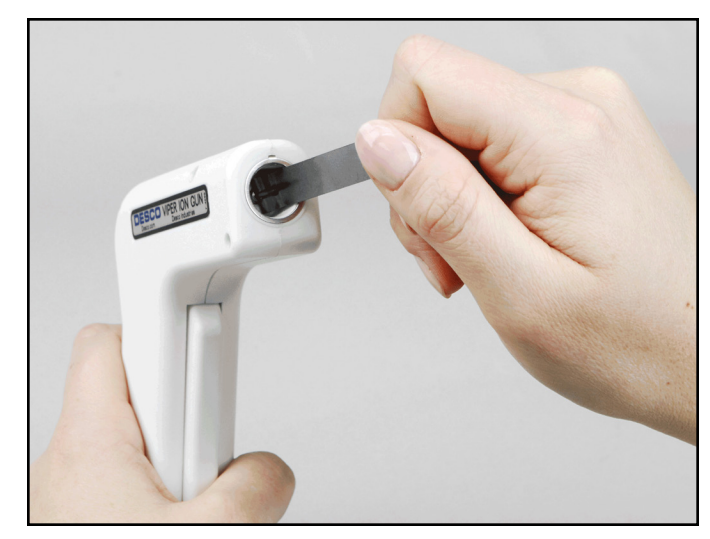
Figure 5. Replacing the emitter point using the tool included in the 19597 Emitter Replacement Kit