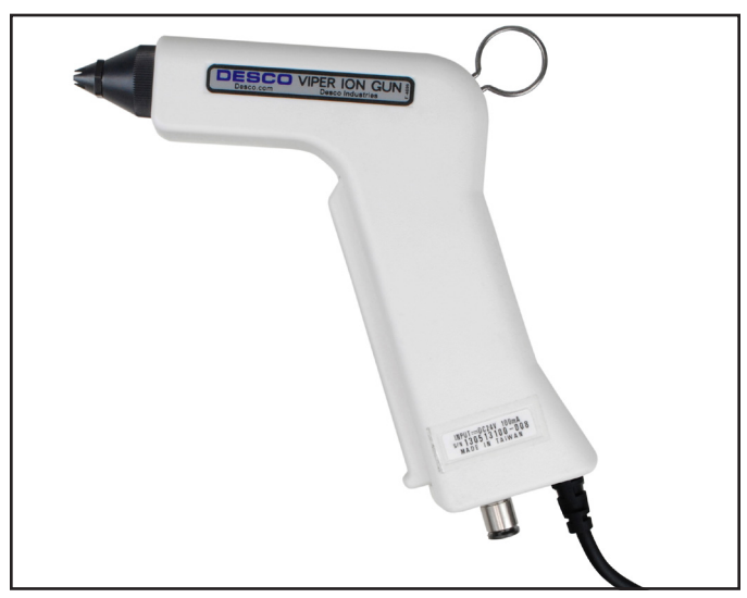
Figure 1. Desco 19595 Viper Ion Gun