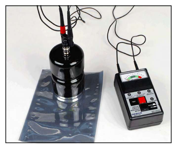
Figure 3. Using the Concentric Ring Probe with the Desco Analog Surface Resistance Meter