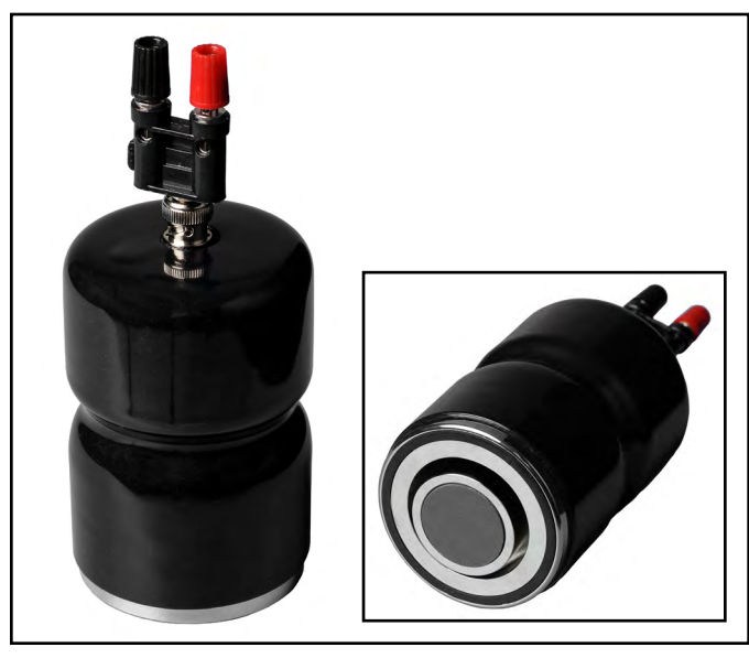
Figure 1. Desco 50005 Concentric Ring Probe