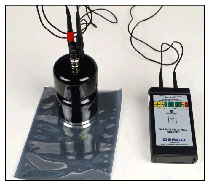
Figure 4. Using the Concentric Ring Probe with the Desco Surface Resistance Checker