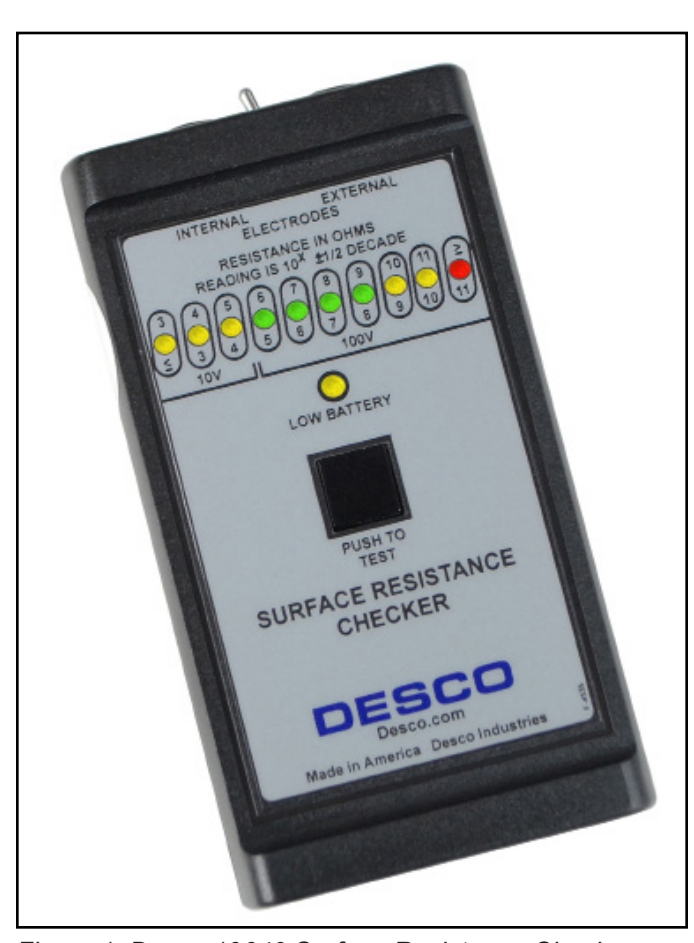
Figure 1. Desco 19640 Surface Resistance Checker