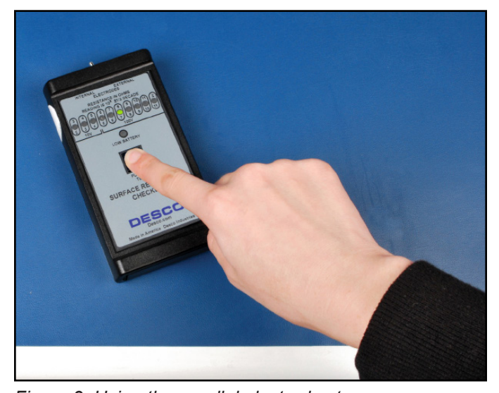
Figure 3. Using the parallel electrodes to measure surface resistance

If the measurement is outside acceptable limits, clean the surface with an ESD cleaner containing no insulative silicone such as Desco 10435 Reztore® Surface & Mat Cleaner, and re-test to determine if the cause of failure is an insulative dirt layer or the ESD worksurface material.