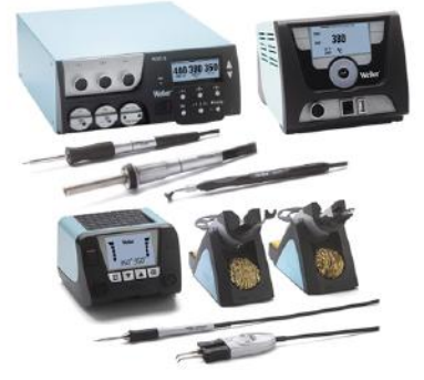
Repair & Rework Soldering Units