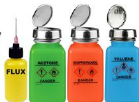
Dispensers & Pumps