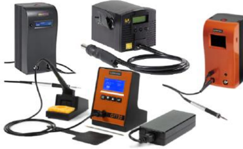
Preheaters Fixed Temperature Soldering Systems