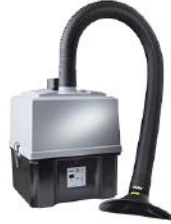
Solder Tip Extraction