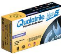
Nitrile, Heat Resistant & ESD Gloves