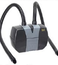
Under the Bench