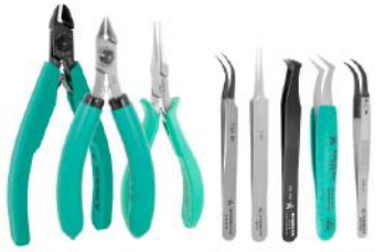
Precision Cutters, Tweezers & Pliers