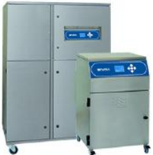
Multi-use HEPA Filtration