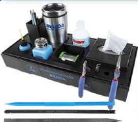
5S Tool Organizers