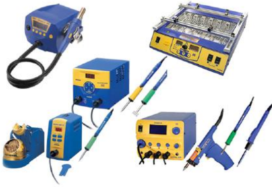
Variable Temperature Solder Stations