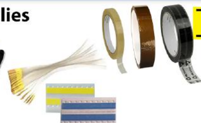
Cover Tape Extenders & Splice Tape