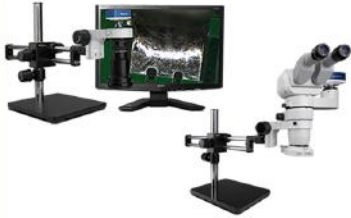
Digital, Video, Binoc & Trinoc Systems