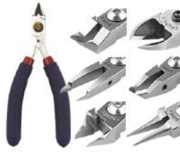
Hard Wire Cutters