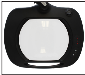
7.5" x 6.2", 5-Diopter Lens 2.25x Magnification