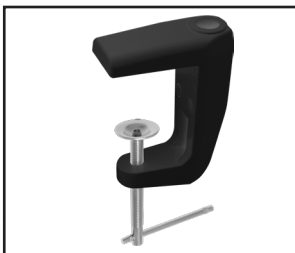
Heavy Duty Mounting Clamp

Color Temperature Range: 3500K—6500K LUX Rating: 6500LX LED lifespan: 20,00 hours minimum