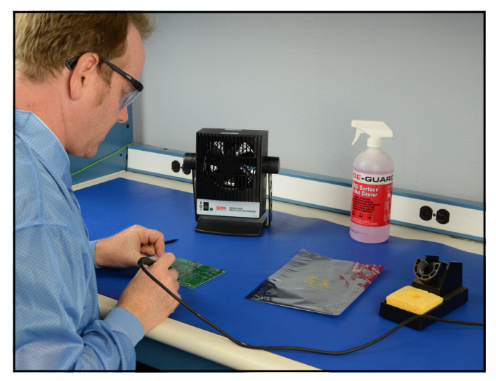
Figure 2. Using the 963E Benchtop Air Ionizer