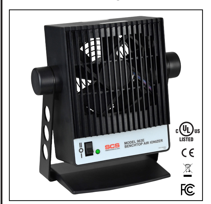
Figure 1. SCS 963E Benchtop Air Ionizer