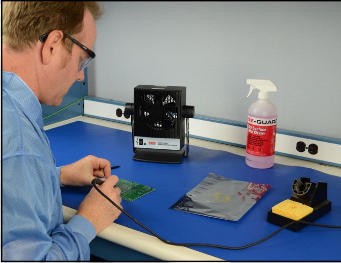
Figure 2. Using the 963E Benchtop Air Ionizer