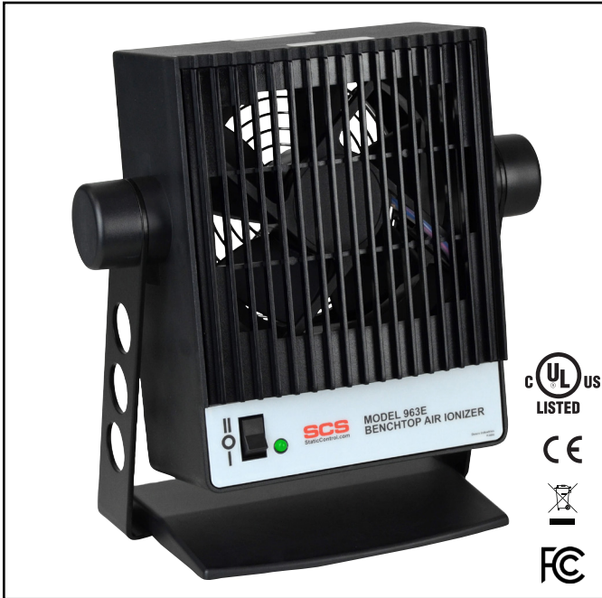
Figure 1. SCS 963E Benchtop Air Ionizer

The 963E Benchtop Air Ionizer and its accessories are available as the following item numbers: