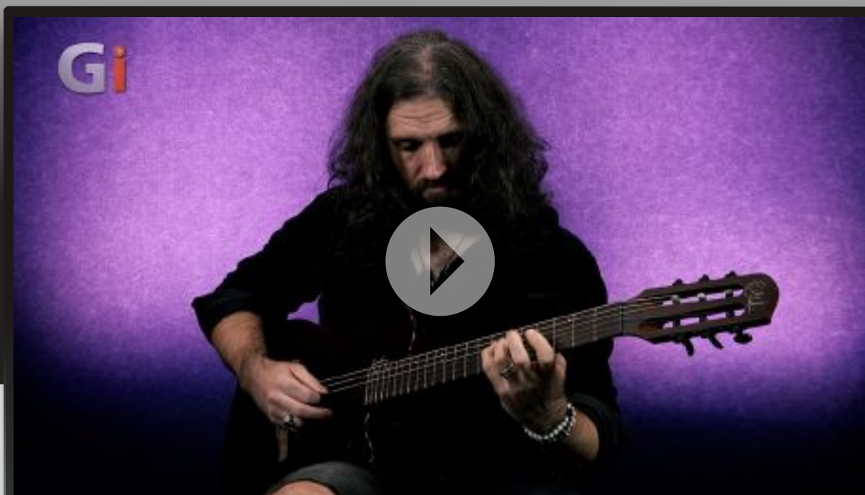
Godin Multiac Mundial Electro-Acoustic

The new Multiac Mundial is a modern, elegant reskin of this classic design in a suite of clean finishes, along with a unique wood combination of Cedar top, Silver Leaf ▶